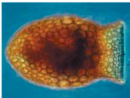
Codonella elongata