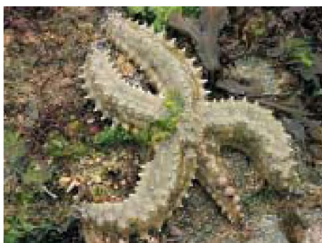
Marthasterias glacialis (Linnaeus, 1758)