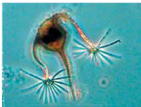
Ceratium ranipes (Cleve, 1900)