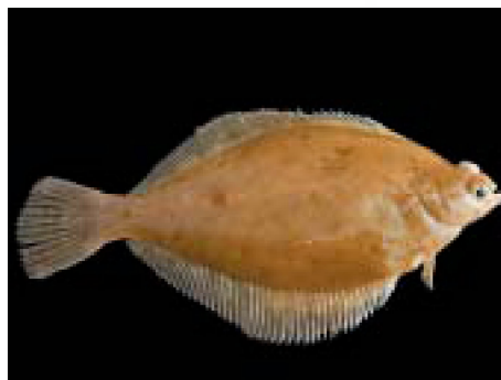
Limanda limanda (Linnaeus, 1758)