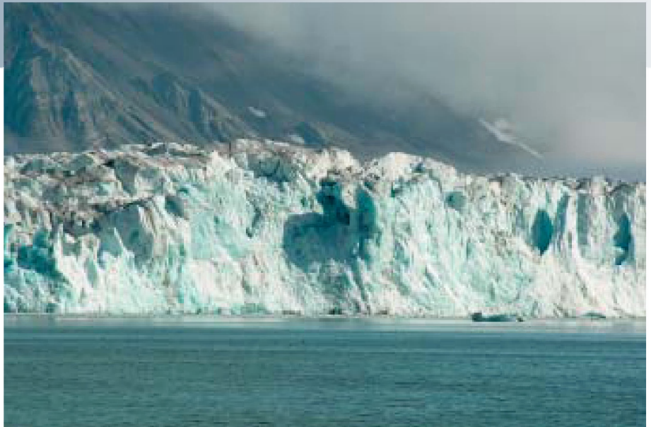
Kongsfjorden, the glacial bay (Bay station).

The changing environmental situation does not seem to affect the benthic assemblages in a direct way. The outer part of the fjord is exposed to changeable hydrological conditions, but still the conditions are far more stable than in the glacial bay. Any change in environmental conditions would affect the benthos far more than in the glacial bay,