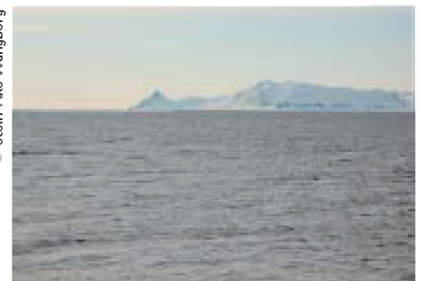
Kongsfjorden, the fjord opening (Out station).

Kongsfjorden hosts the most active tidal glacier of Svalbard Archipelago, Kongsbreen, which is retreating at a rate of up to 0.5km per year. The glacier activity has a direct influence on the benthic communities' diversity and its variability with the scale and magnitude of the impact, depending on the activity of the glacier. Since Kongsfjorden is an open fjord with no sill at the entrance, the exchange across shelf and fjord boundary has a direct impact on biological and physical variation of the benthic system. During the four years of our study, both "cold" (2004 – a large volume of Arctic waters were present at the surface, characterised by lower temperature and salinity and the presence of ice) and "warm" (2002 – where a vast amount of Atlantic water was