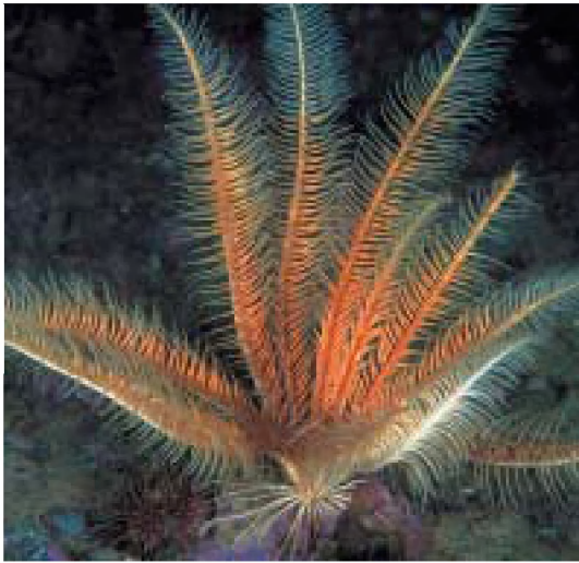
The crinoid Heliometra glacialis .

region (SBI) and the Canadian Archipelago (CASES) – that extend the Norwegian findings across the pan-arctic region. This will be supplemented by a full programme of invited and submitted presentations.