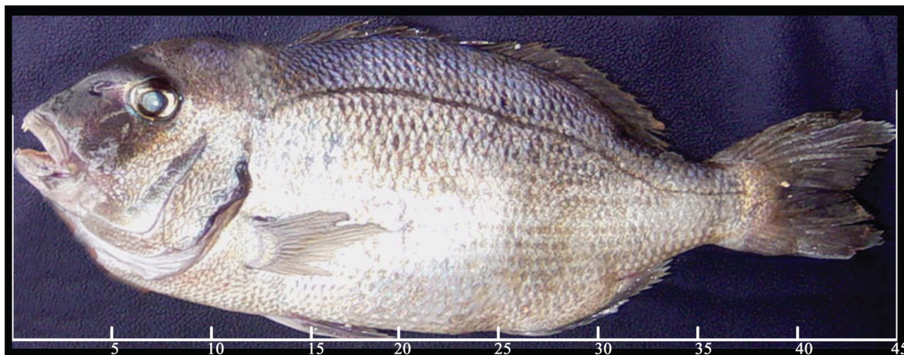
FIG. 1. – Specimen of Pagrus major (TL = 44.9 cm) caught near Cape Bonaster (Island Molat, eastern middle Adriatic).