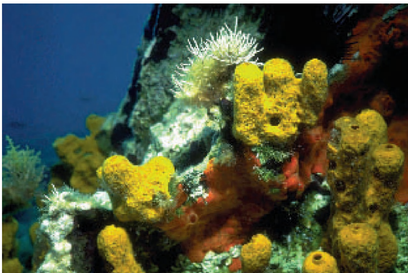
Sponges colonising the hard substrate in the Eastern Mediterranean. Sponges provide structure for other marine species, they are a traditional commercial resource while they are recently used as source of several biomedical products. After 1986 a disease affected several Mediterranean species resulting in severe reduction of local populations.

T his science plan aims to identify (a) the scientific questions that need to be resolved, (b) the actions that require Europe-wide collaboration, and (c) the end products necessary for the scientific support of management for the sustainable use of the goods and services provided by marine ecosystems in Europe.