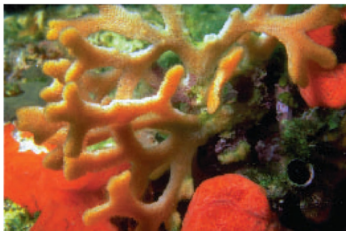
Marine organisms living in close association one with the other, modifying the texture of the seabed and contributing to the increase in spatial heterogeneity. The nature of these interspecific interactions is still largely unknown.

Fisheries policies at the moment are rapidly moving away from single to multispecies assessments. A number of programmes originated or co-ordinated by ICES (The International Council for the Exploration of the Seas) already implicate global change processes in the study of commercial fish populations (Cod and Climate, GLOBEC). Besides fisheries, marine aquaculture is an important and growing economic activity in countries such as