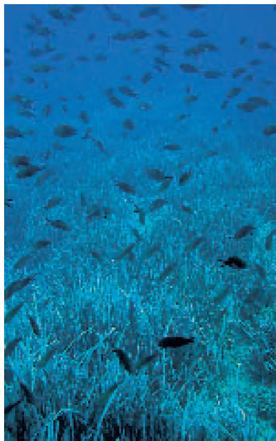
Seagrass meadows, such as the Posidonia oceanica meadow shown, provide important services in the ecosystem, such as habitat for fauna and physical protection of the coastal zone.