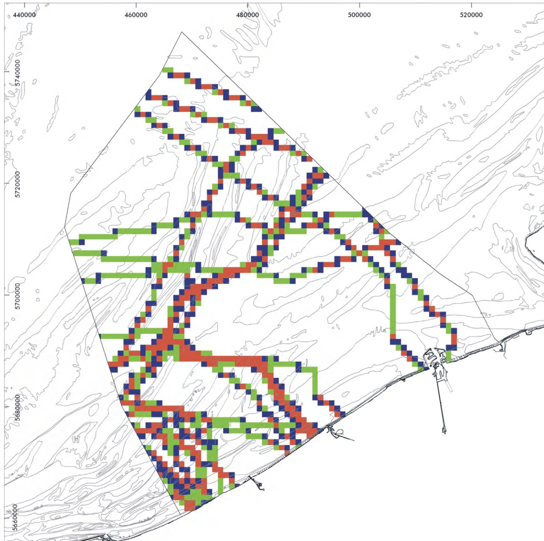
Map I.2.1b. Cables: use intensity

Use intensity of cables (length of cable (m)/km 2 )