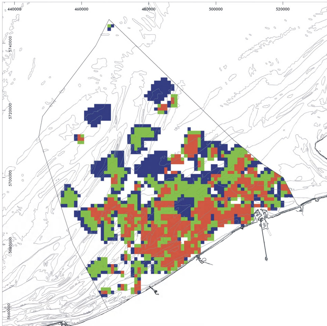
Map I.3.4b. Fisheries (fishing): spatial distribution and use intensity

Use intensity of commercial fisheries (only vessels that are fishing) (relative number of observed shipping vessels/year/km 2 )