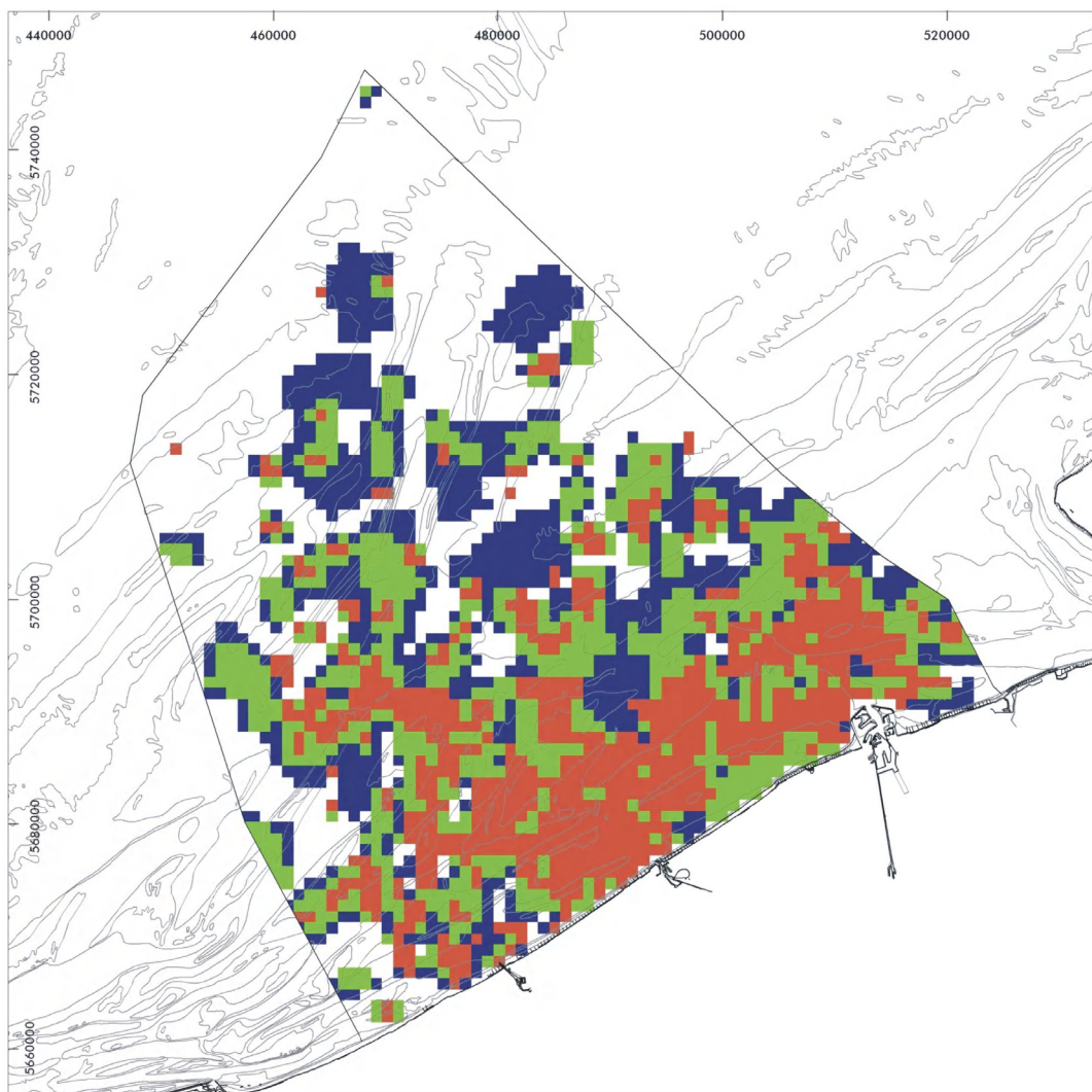
Map I.3.4c. Fisheries (fishing and non-fishing): spatial distribution and use intensity

Use intensity of commercial fisheries (both non-fishing and fishing vessels) (relative number of observed shipping vessels/year/km 2 )