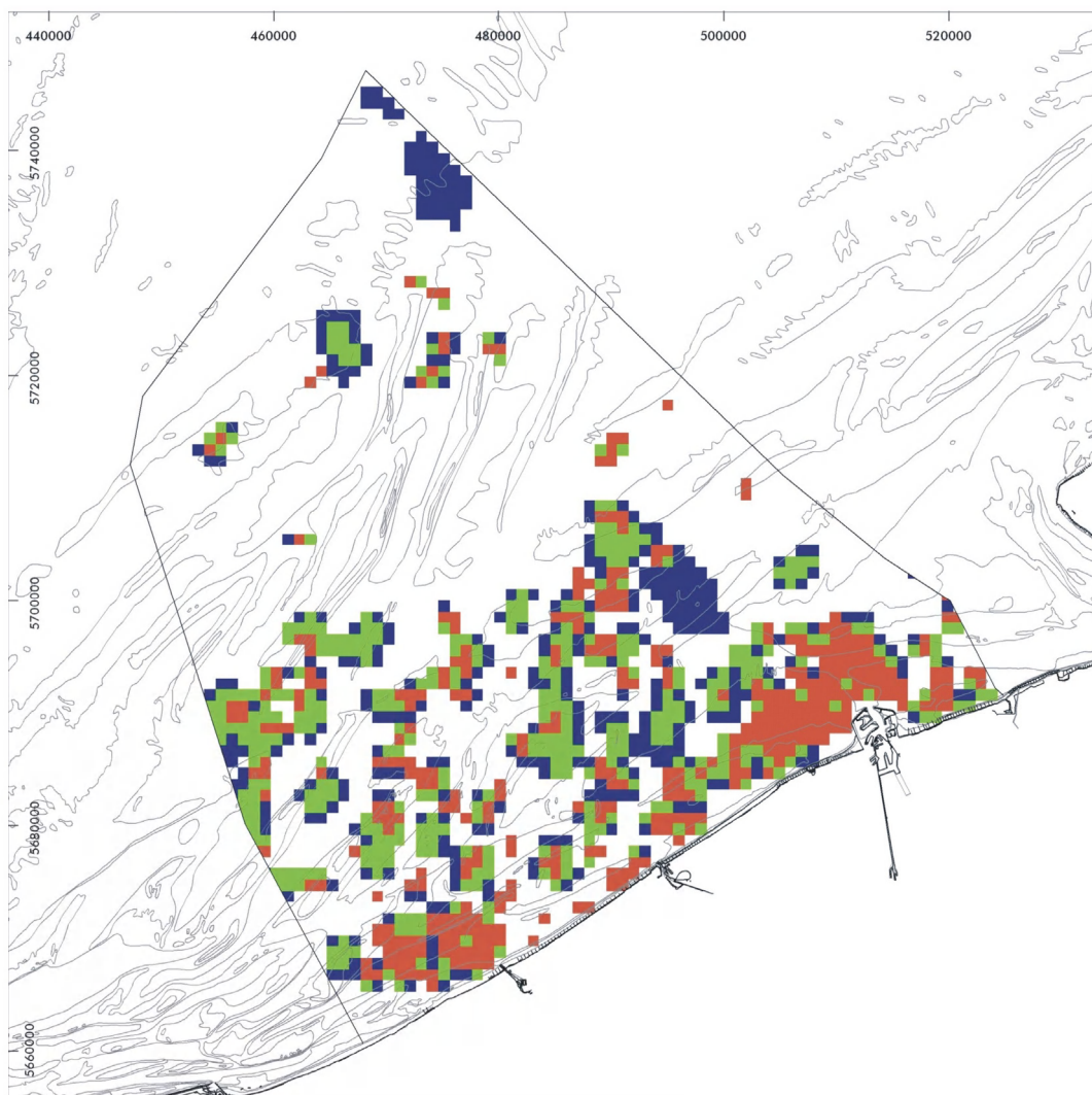
Map I.3.9a. Recreation and tourism at sea (recreational fisheries): spatial distribution and use intensity

Use intensity of recreational fishing at sea (relative number of observed recreational fishing vessels/year/km 2 )