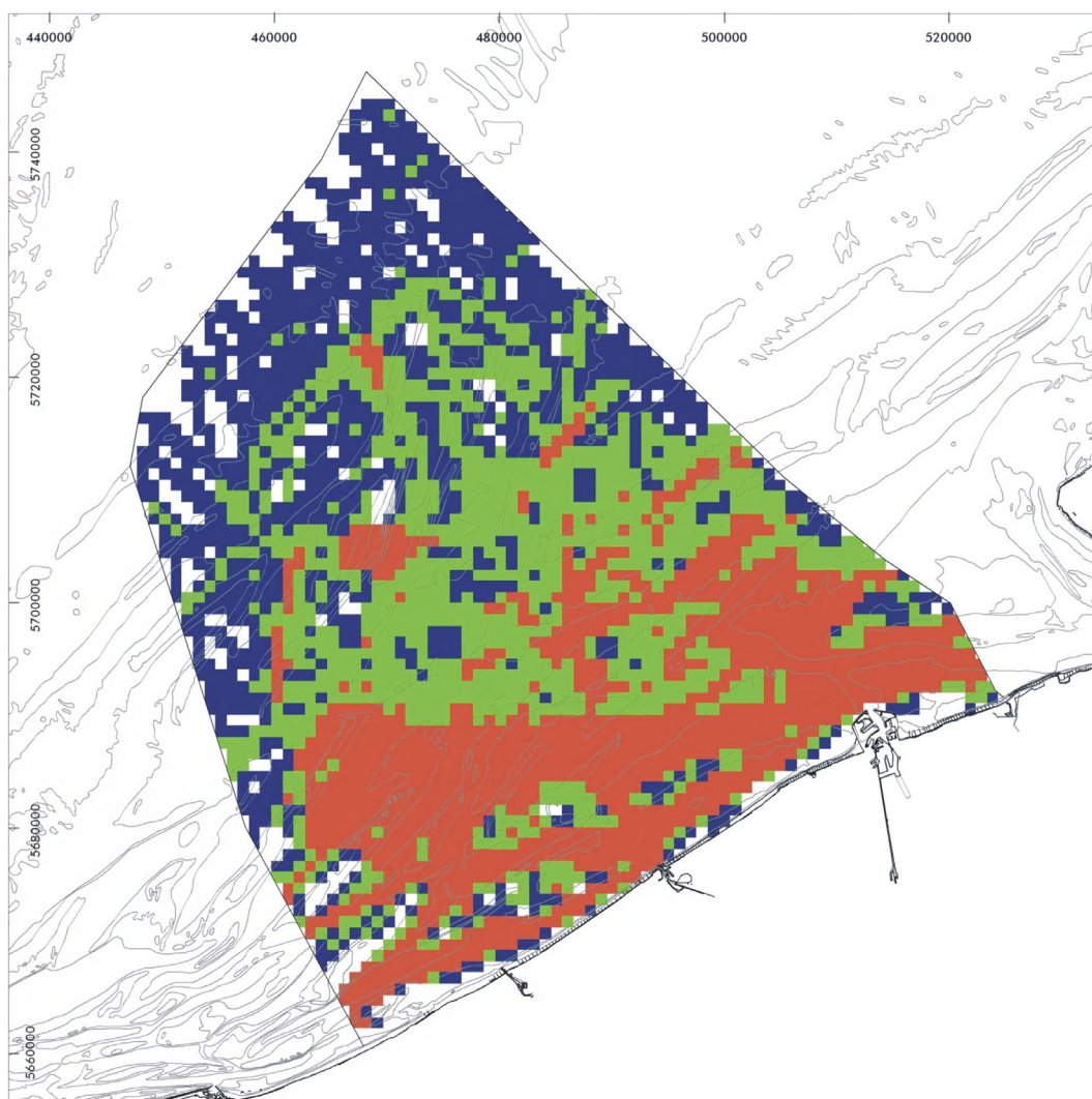
Map I.3.11b. Scientific research (fast): spatial distribution and use intensity

Use intensity of research (speed over ground > 1 knot (mean presence time/years(hours)/km 2 )