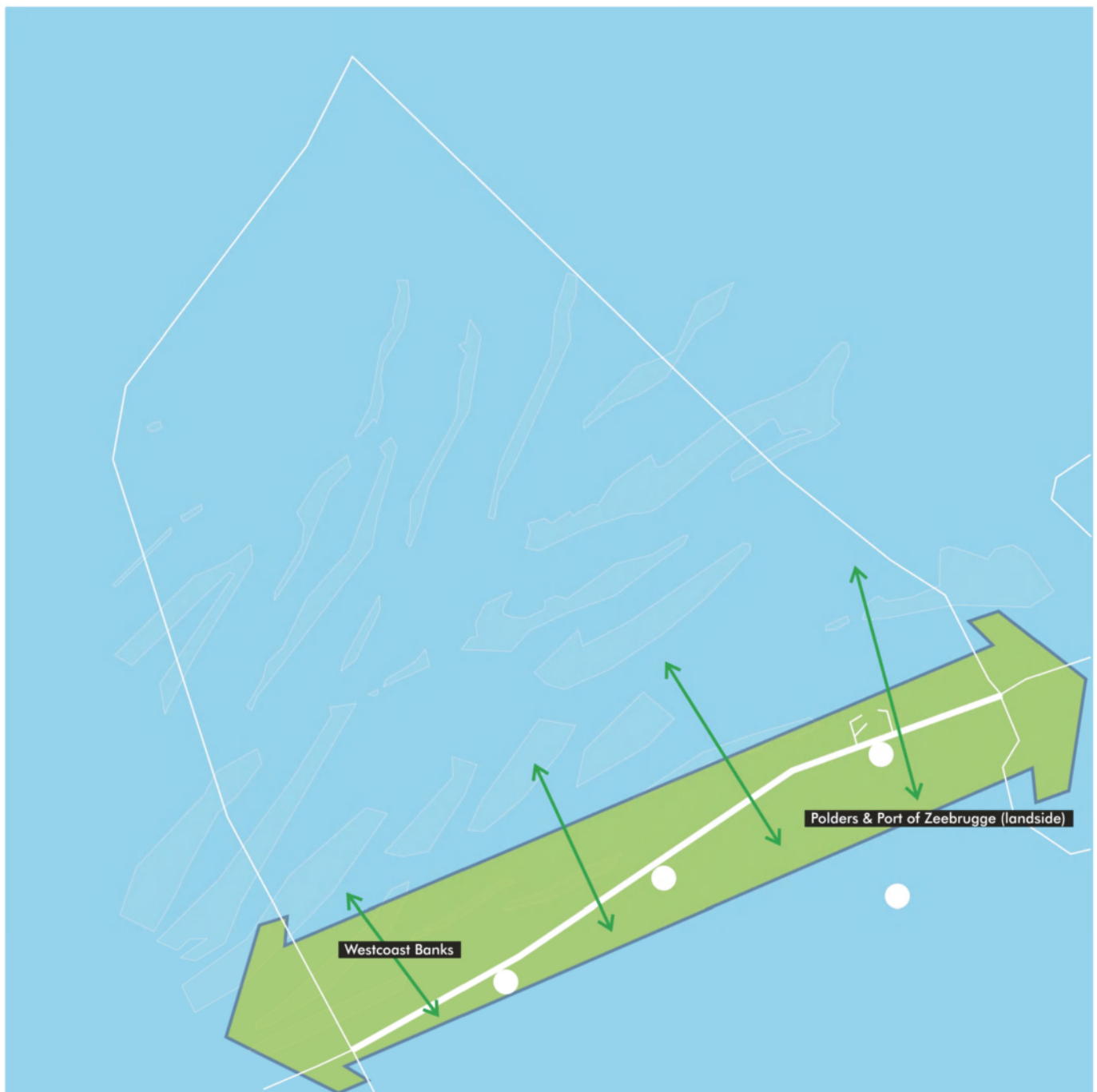
Map III.1.2.3e. Existing spatial structure: natural values in the BPNS (Structure map: Maritime Institute - Gent University)