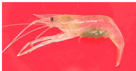
Figure 3. Palaemon macrodactylus , ovigerous female, 45 mm, Gironde Estuary, France

We can assume that interactions between the two species could be considerable and could perhaps lead to a decrease in the native shrimp population abundance. In California, Ricketts et al. (1968) observed that P. macrodactylus was responsible for the disappearance of the native Crangon spp. Furthermore, Gil-Turnes et al (1989) found fungi associated with P. macrodactylus which, if confirmed in the Gironde, raises the possibility of new diseases being introduced that may affect the native shrimps.