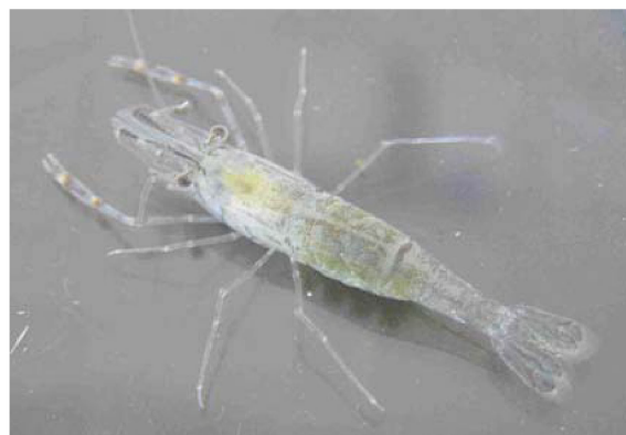
Figure 2. Palaemon macrodactylus , ovigerous female, 50 mm, Gironde Estuary, France

P. macrodactylus is very similar to the resident species P. longirostris . Both are strong osmoregulators (Born 1968, Campbell and Jones 1989) and are typical estuarine species with similar diets, consisting mainly of mysids and copepods (Siegfried 1982, Sitts and Knight 1979, Sorbe 1983). We can assume that food competition will take place between the two species and even with another common species, Crangon crangon Linnaeus, 1758. There is also evidence of cannibalism when individuals are kept in crowded laboratory conditions (Newman 1963), so the species could prey on other carideans in the estuaries. Moreover, each age group of P. macrodactylus produces at least two cohorts compared with only one or two for P. longirostris (Aurousseau 1984, Omori and Chida 1988).