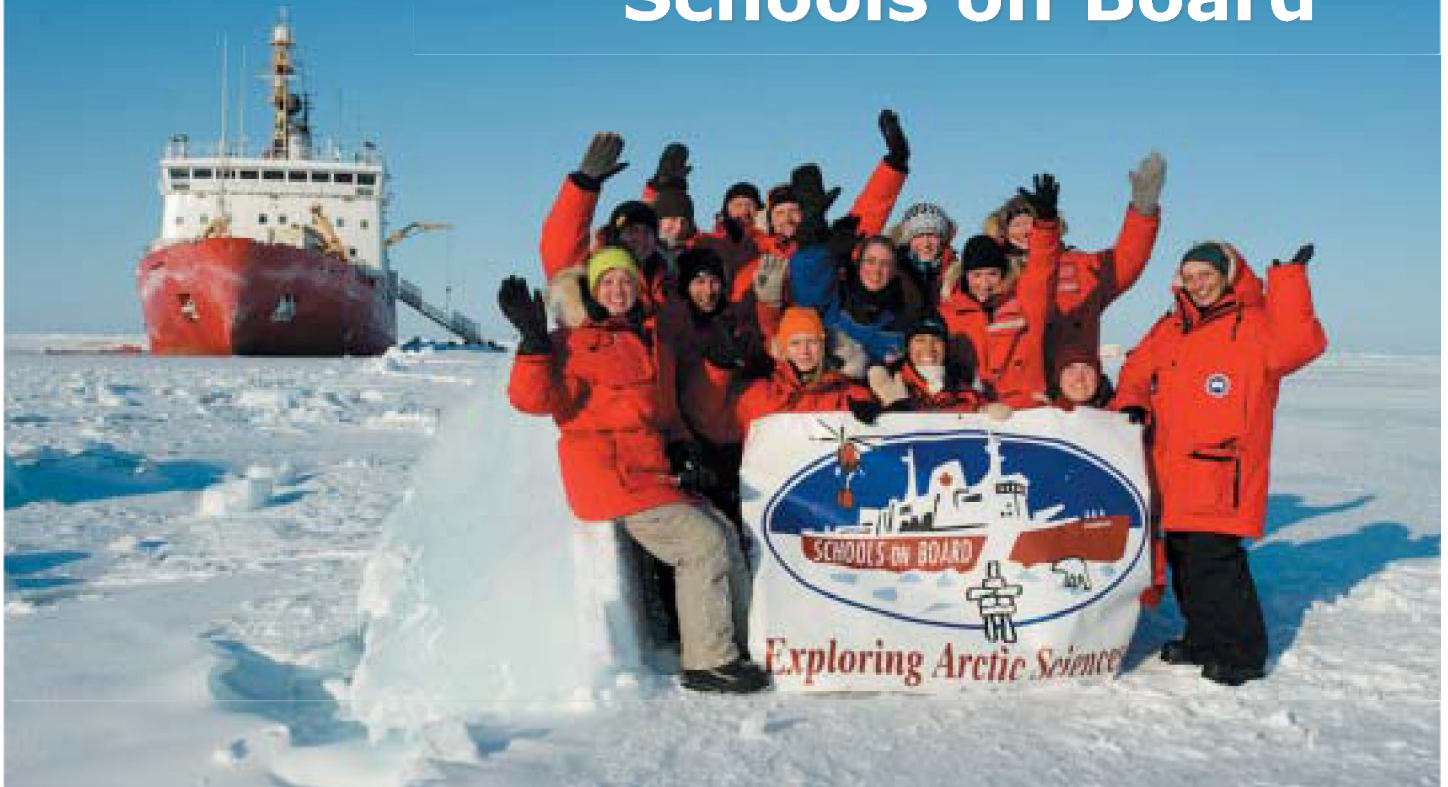
Schools on Board group, including students and teachers from Scotland, Norway, Sweden, Germany and Canada.