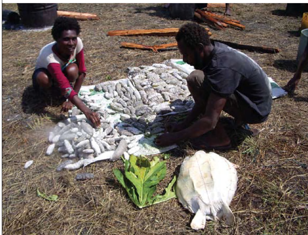
FIGURE 3 Juvenile green turtle ( Chelonia mydas ) caught as bycatch in the sea cucumber fishery in Papua New Guinea Western Province