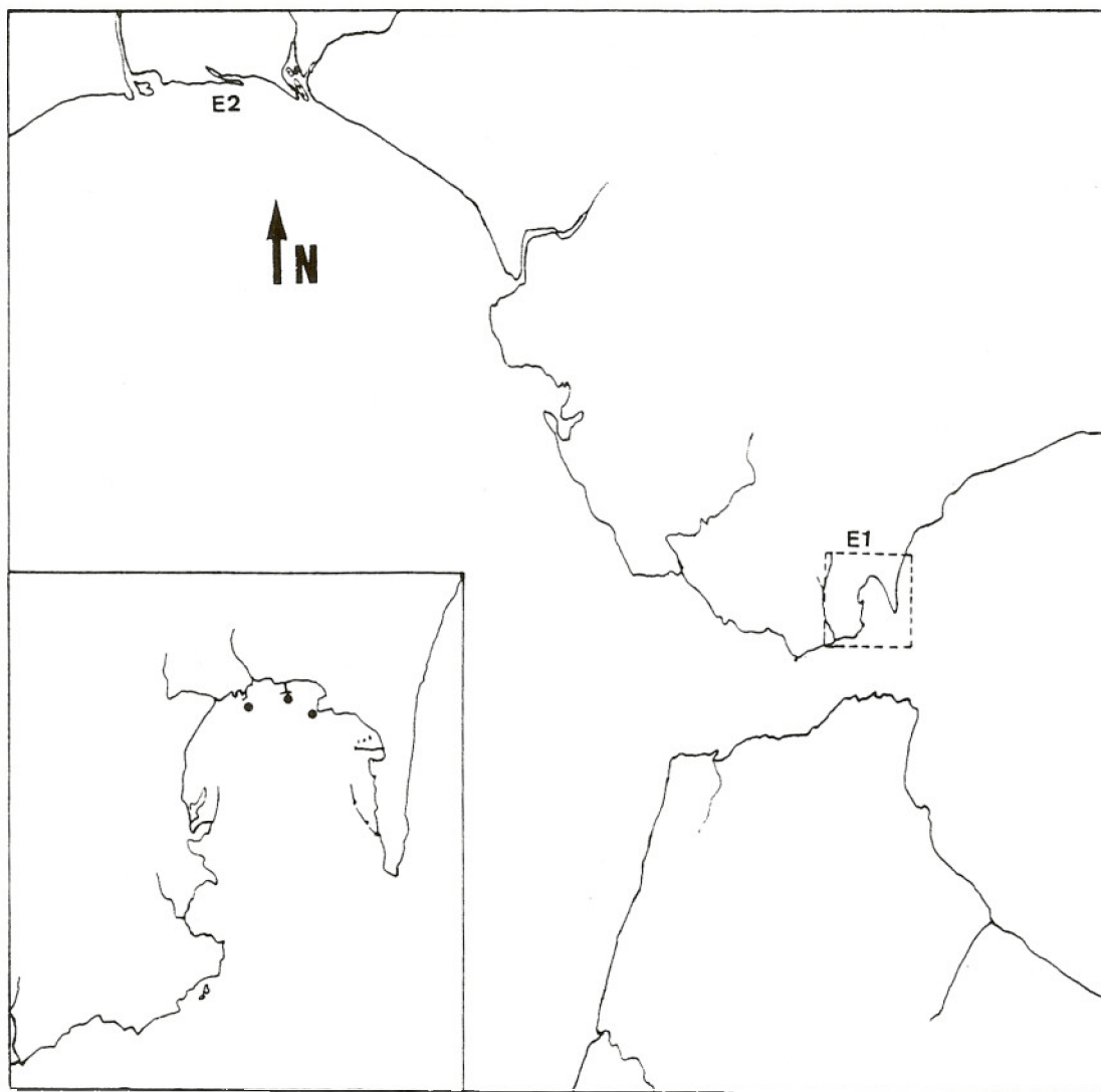
Fig. 1. Map of sampling localities (E1. Algeciras Bay; E2. La Antilla). Dots show where Mycale micracanthoxea is found.

knowledge on litoral sponges from the area is dispersed and only some works dealing with nearby areas have been published (Pansini, 1987; Maldonado, 1992). In this paper we redescribe Mycale micracanthoxea , a little known north Atlantic species. Some anatomical differences observed were considered inherent to species variability within a geographical range.