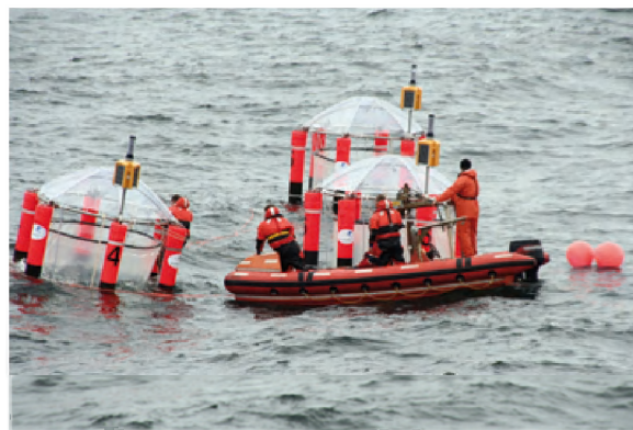
Study of ocean acidification in offshore mesocosm CO 2 perturbation experiments.

The effect of ocean acidification on the global economy will depend on adaptations of the marine ecosystem as well as on human adaptation policies. Both are difficult to anticipate, making it difficult to calculate economic impact. A collaboration of natural and social sciences is required to research the potential for adaptation in both ecosystems and human systems, and the interplay between the two. The costs of adapting to ocean acidification need to be assessed.