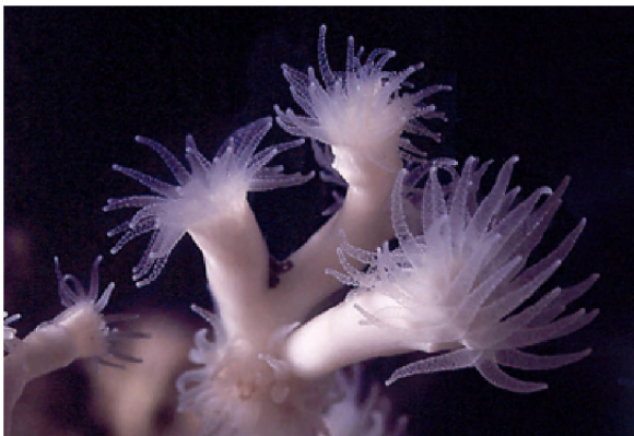
Lophelia pertusa – a cold-water reef-forming coral that lives in deeper water — is widespread across all oceans and, with other calcareous organisms, is threatened by ocean acidification.