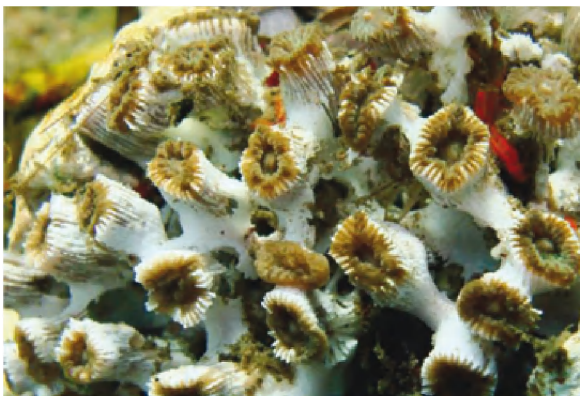
Endemic Mediterranean coral Cladocora caespitosa showing severe skeletal damage and dissolution due to ocean acidification.