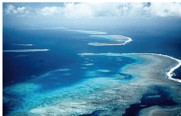
Aerial view of the Great Barrier Reef, one of the world's best protected and most fragile marine ecosystems.

Changes in the global biogeochemical cycles operate on different time scales. Uptake of \text{CO}_2 and transport to the ocean interior is a rather rapid process (of the order of weeks to centuries). The effect of increased sedimentary carbonate dissolution (compensating ocean acidification) operates on intermediate timescales of the order of thousands of years. Ultimate recovery of the oceans from