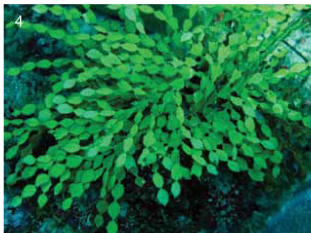
Figure 4 Halimeda minima , common in shaded areas in most habitats.