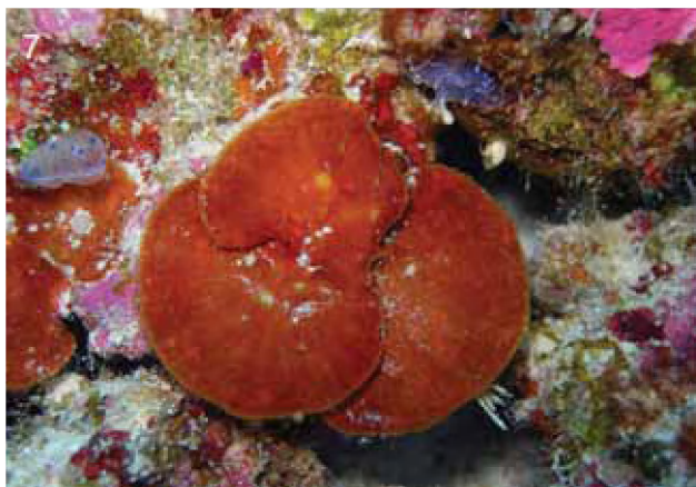
Figure 7 Peyssonnelia inamoena , on vertical walls in many habitats

Over 120 species of macroalgae and seagrasses are reported for the Rowley Shoals, Scott Reef and Seringapatam Reef. This represents a significant contribution towards documenting the marine flora of these reefs. Once the smaller, cryptic epiphytic algae are fully assessed, the species