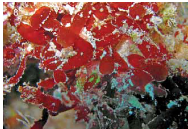
Figure 8 Corynocystis prostrata , newly recorded for Western Australia