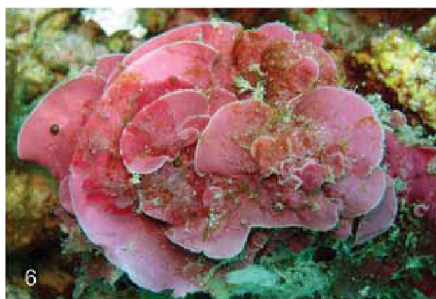
Figure 6 Rhizolamellia collum , restricted to dark crevices on reef fronts