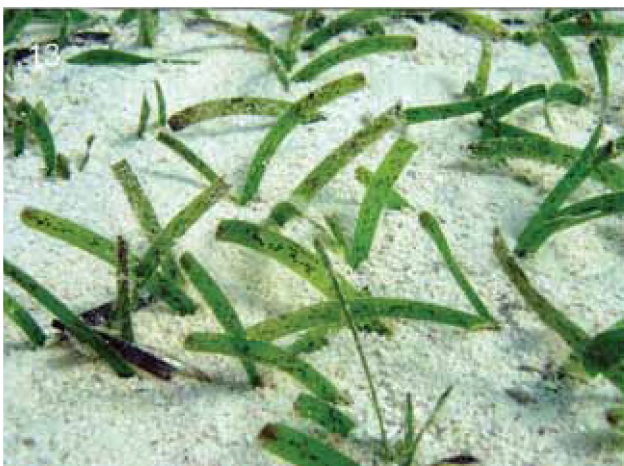
Figure 13 Thalassia hemprichii , occasionally in dense stands in sandy habitats