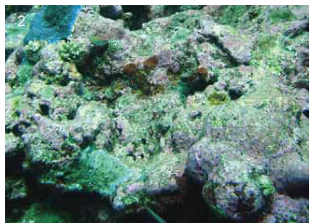
Figure 2. Hydrolithon onkodes , typical of high energy reef crests.