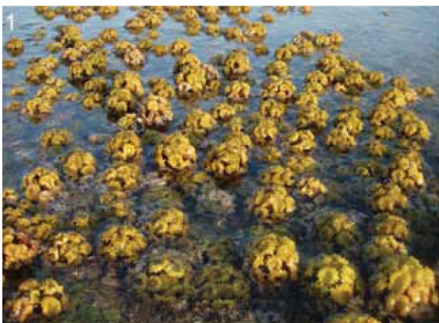
Figure 1 Turbinaria ornata , dense cover at Seringapatam Reef.

During each survey, the algal flora was assessed visually and by specimen collection, either by SCUBA, snorkelling or reef walking. SCUBA diving was only undertaken during the September 2006 and December 2007 surveys. Sampling