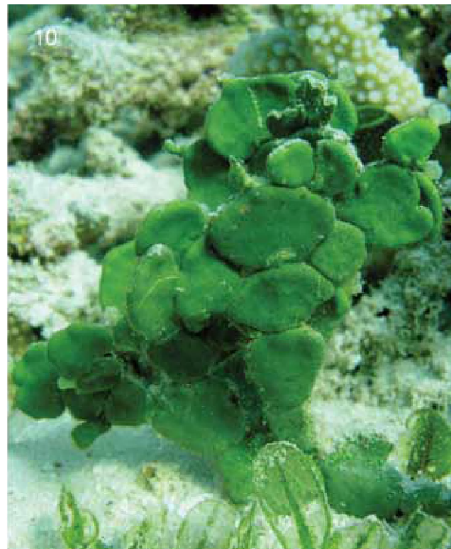
Figure 10 Halimeda macroloba , a species restricted to sandy habitats