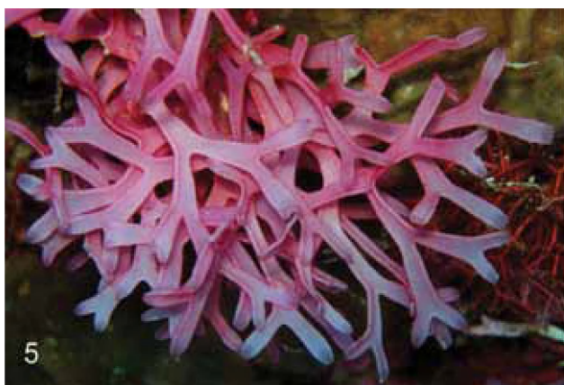
Figure 5 Dichotomaria marginata , generally in reef front habitats.