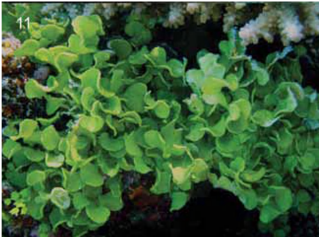
Figure 11 Halimeda macrophysa , with ruffled segments