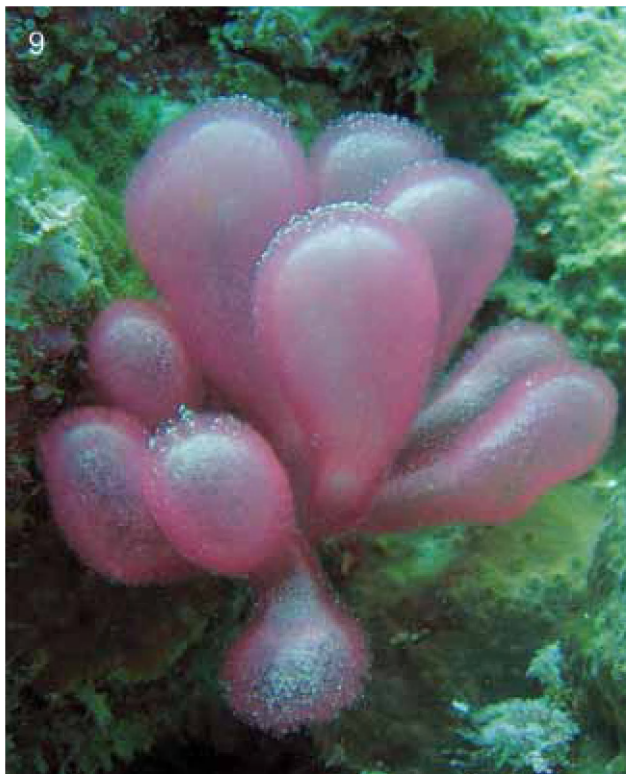
Figure 9 Gibsmithia hawaiiensis , an unusual gelatinous red alga.

The Indo-Pacific algal flora is very diverse and covers a large area. Some subsets of the region are regarded as biodiversity hotspots, for example the Philippines with some 900 species recorded (Silva et al. , 1987), but this high diversity often also reflects collection effort. Macroalgal studies in some regions have been ongoing for over a century (e.g. Indonesia, beginning with Weber-van Bosse & Foslie 1904) and these regions continue to be studied by primarily European botanists (e.g.