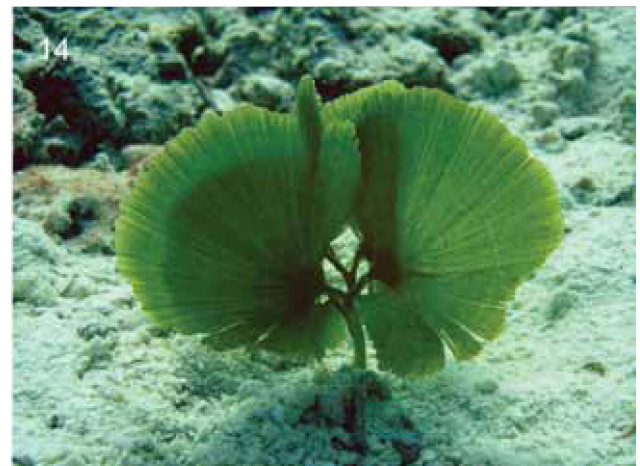
Figure 14 Udotea glaucescens , a fan shaped green alga.

Verheij & Prud'homme van Reine 1993). However, much of the Indo-Pacific region is also currently poorly known, particularly so tropical northwestern Australia where, up until some 8 years ago, less than 30 algal species were recorded (Huisman et al. , 1998). Ongoing studies are rapidly changing this situation and presently the known (but mostly unpublished) northwestern Australian flora totals over 350 species. Specimens of possibly another 100 species have been collected, but these are as yet unidentified (unpublished obs.). Thus any assessment of the Rowleys/Scott/Seringapatam algal floras must be viewed against this backdrop, acknowledging that there is much that is still unknown.