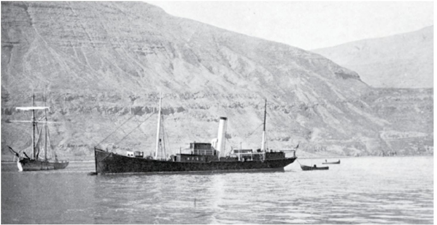
▲ RV "Thor" in Icelandic waters in 1903. It is anchored alongside a French fishing schooner.

Schmidt participated in (or led) six expeditions on the RV "Thor" between 1903 and 1908, conducting early life history surveys (plankton and oceanographic observations) covering the broad area from Iceland to Spain. He was subsequently the principal author of an extensive and influential 1909 ICES report that presented a synthesis of the aggregated results of the Danish expeditions as well as surveys by other ICES Member States.