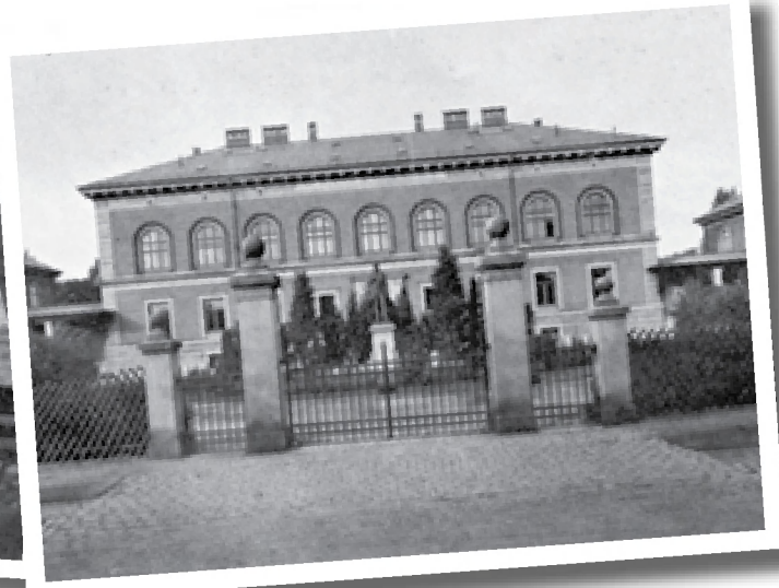
▲ The Carlsberg Laboratory, flanked by the two directors' residences.

Thus, 2010 is the 100th anniversary of the "Thor" expedition on eel early-life history in the Northeast Atlantic, the 90th anniversary of the "Dana 1" expedition on the biogeography of fish eggs and larvae in the North Atlantic, and the 80th anniversary of the completion of the "Dana 2" global expedition on marine biodiversity. As it is also the International Year of Biodiversity and the culmination of the first Census of Marine Life, it is a great year to celebrate and acknowledge the Carlsberg contribution to our knowledge of marine science.