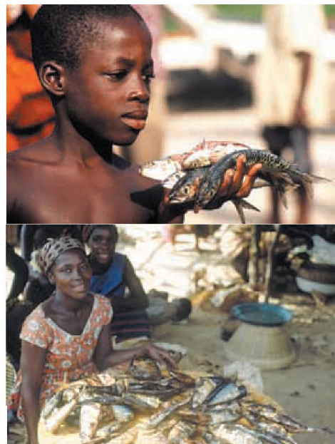
ABOVE: Poorly-selective fishing in developing countries can have significant impacts on food security and employment.

Reduction campaign, and the focus of our management recommendations on bycatch. These recommendations were most recently presented at the Fourth World Fisheries Congress in 2004, and are also outlined in EJF's campaign report Squandering the Seas (EJF, 2003).