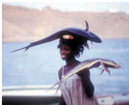
ABOVE: Bycatch limits are specified in a minority of EU fishing agreements with developing countries.