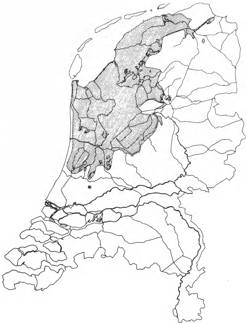
Fig. 1. The approximate distribution area of Gammarus tigrinus in the Netherlands in 1973.

pletely disappeared from the area now occupied by G. tigrinus .