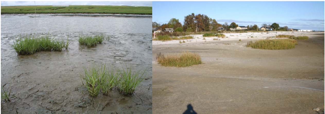
Fig. 3. Spartina anglica seedlings: Elbe estuary, Germany, August 2004. Fig. 4. Spartina anglica clumps on a sandy beach in a recreation area: Udbyhøj, Randers Fjord, Denmark, October 2005.