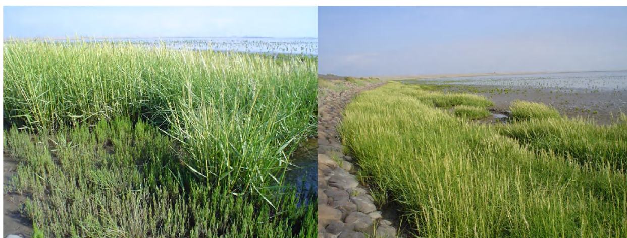
Fig. 1. Spartina anglica (at the back) displaces i.a. the native glass-wort Salicornia stricta (in the foreground): Wadden Sea of Schleswig-Holstein near Eider estuary, Germany, August 2004, photo by Stefan Nehring. Fig. 2. Spartina anglica sward: Wadden Sea of Schleswig-Holstein near Eider estuary, Germany, August 2004, photo by Stefan Nehring.

Common names: Common cord-grass, English cord-grass, rice grass, salt marsh-grass (GB), Vadegræs, Hybrid-Vadegræs (only for the sterile hybrid) (DK), Englisches Schlickgras, Reisgras, Salz-Schlickgras (DE), Engels Slijkgras (NL), Marsk-gräs (SE), englanninmarskiheinä (FI)