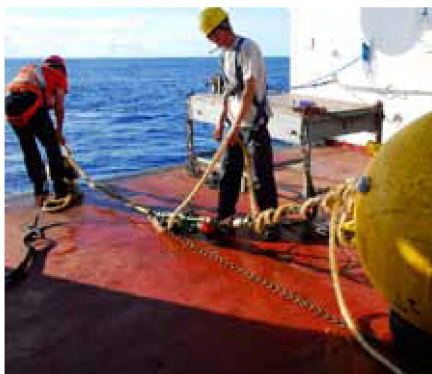
Top section of a RAPID mooring about to be deployed at 26N from RRS Discovery