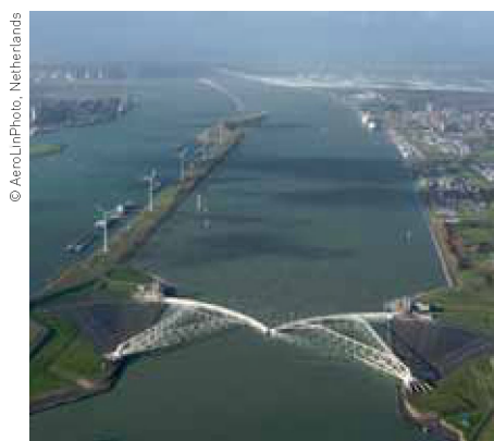
The Maeslantkering storm surge barrier in the Netherlands automatically closes when needed for protection. It is part of the Delta Works and it is one of largest moving structures on Earth.

Local sea levels are influenced by further factors, including changes in atmospheric pressure and wind distribution, oceanic circulation, local temperature and salinity, sediment supply and sediment compaction at estuaries, land movements caused by removal of mass from the earth's crust and tectonic movements.