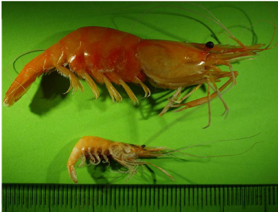
Figure 3. Ovigerous P. macrodactylus females: age 2+ (top) and 0+ (bottom). Divisions on the scale bar are millimeters