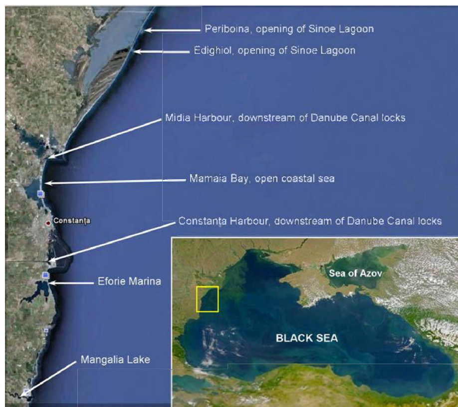
Figure 1. The Black Sea with the study area (yellow rectangle) and the sampling sites (white arrows)

Many aspects of the biology of P. macrodactylus have been studied worldwide: life history and reproductive strategies (Omori and Chida 1988a,b,c), egg attachment (Fisher and Clark 1983), brood-associated bacteria (Fisher 1983a), brood infection by a fungus (Fisher 1983b), larval development (Little 1969) and energy budgets (Chin et al. 1992), morphological abnormalities (Beguer et al. 2008), predation and diet (Sitts and Knight 1979; Siegfried 1982; González-Ortegón et al. 2009), estuarine distribution in relation with environmental factors (Ogawa et al. 1983; González-Ortegón et al. 2006), osmoregulation (Born 1968; González-Ortegón et al. 2006) and potential impact as an alien species and mitigation measures (Chicharo et al. 2009; González-Ortegón et al. 2009).