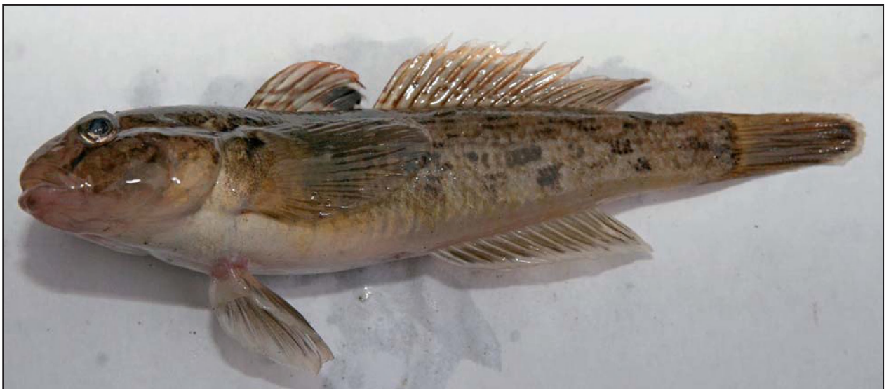
Fig. 2. First recorded specimen of Neogobius melanostomus in Belgium (10.5 cm TL)