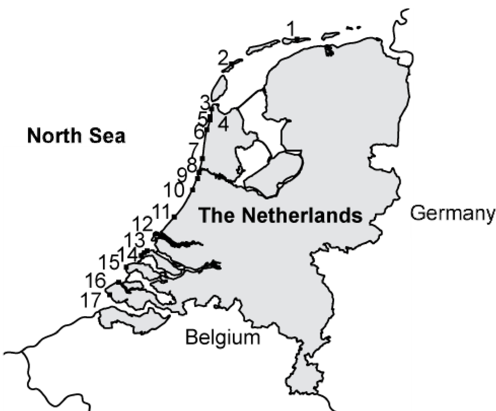
Figure 1. Sampled beaches