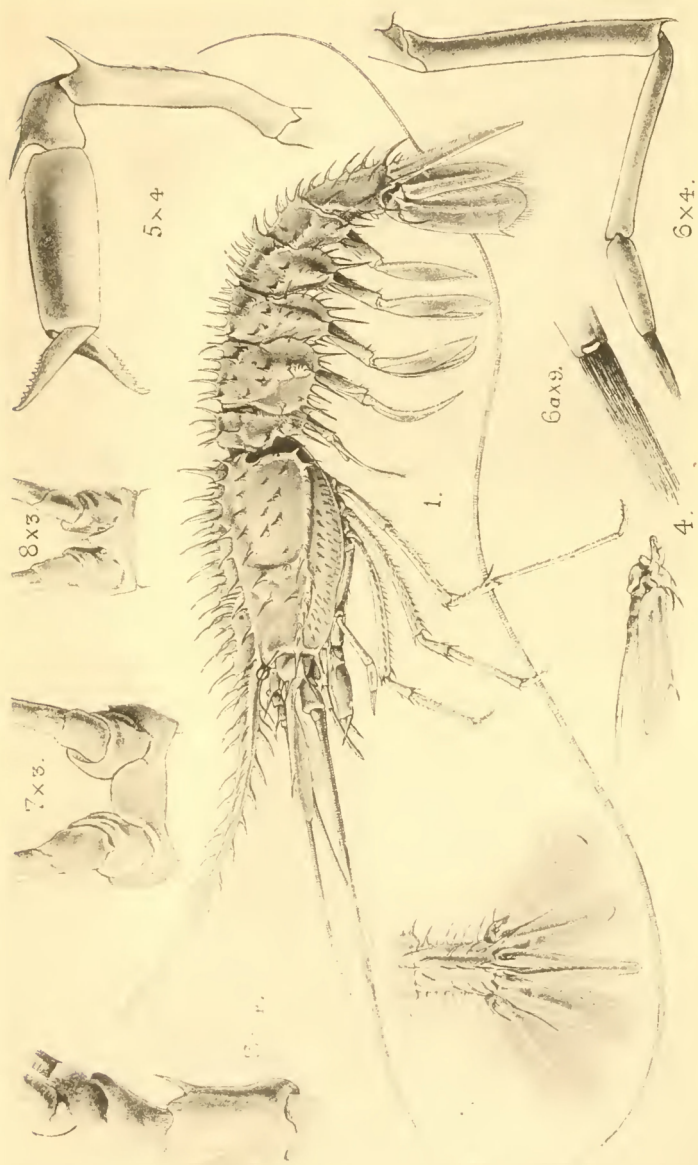
1, 2, & 7 PSALIDOPUS HUNLEVY.