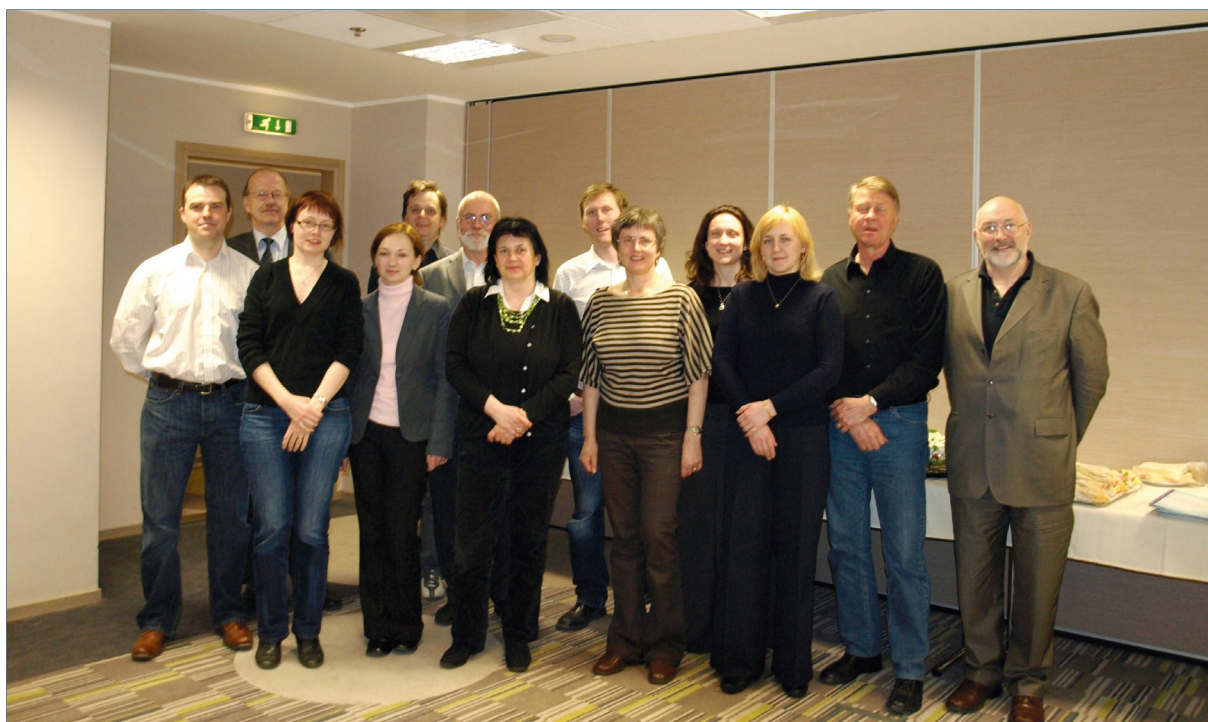
Baltic Sea Workshop – Tallinn, Estonia, 15th - 16th April 2008.