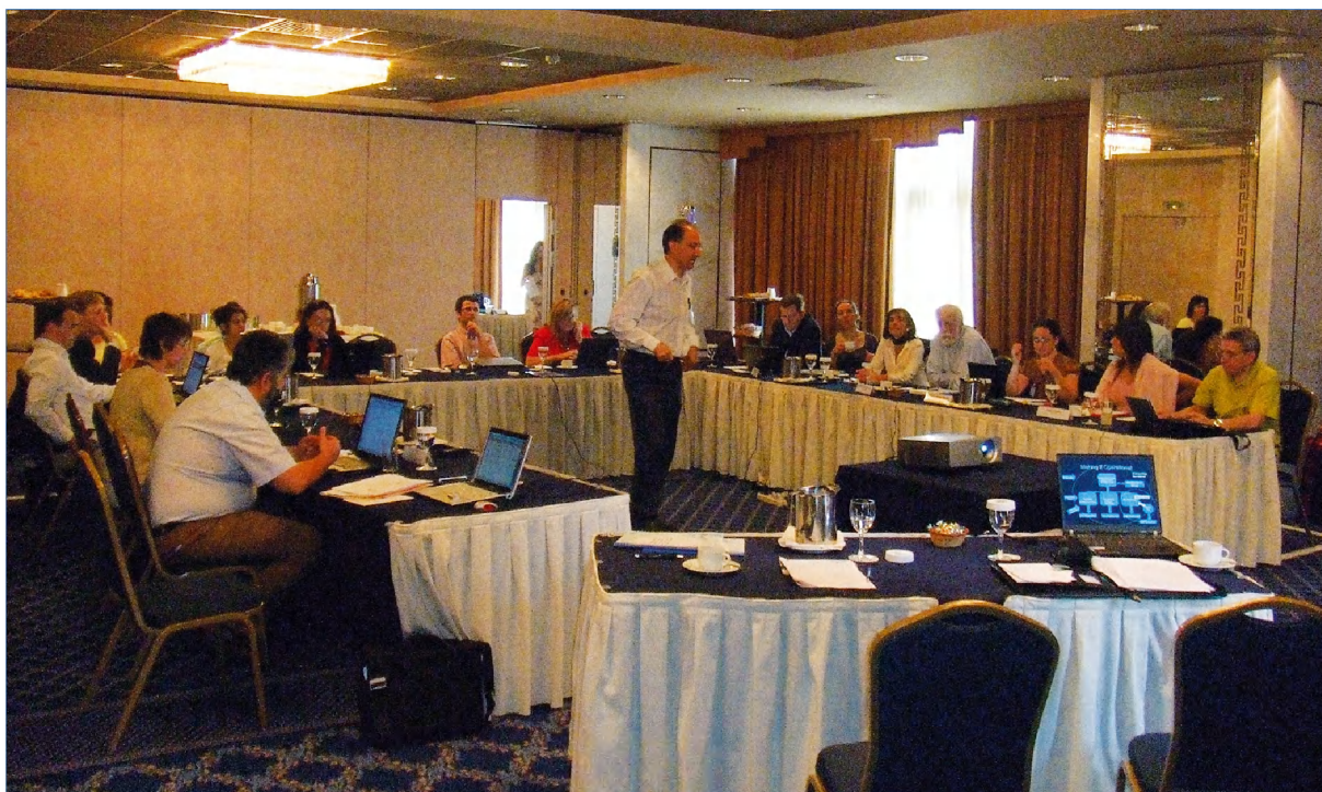
Mediterranean/Black Sea Workshop – Athens, Greece, 4th - 5th June 2008.

Twenty three of the twenty six European Coastal States were represented at these Workshops (Annex 1). Additional data for Latvia, Slovenia and Croatia was sourced, where possible, by correspondence.