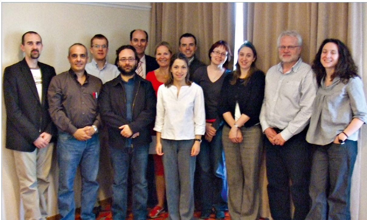
Atlantic Workshop – Oslo, Norway, 27th - 28th May 2008.