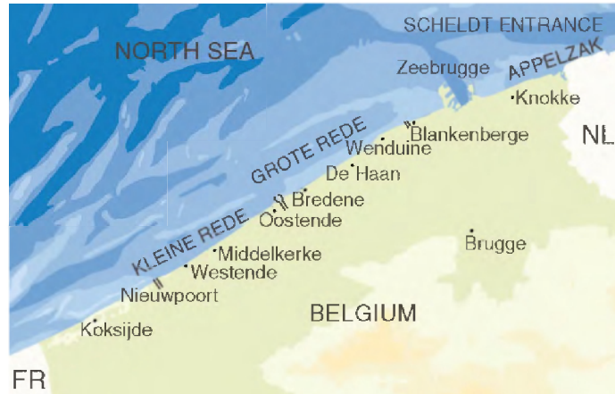
Fig. 1. Map of the Belgian shore with names cited in the text.