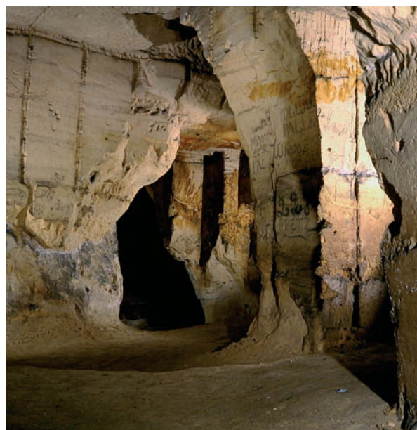
Figure 3: Underground quarry in Nekum calcarenitic limestone, extracted for 'maastrichtsteen' building stone, resulting in rectangular sections. Grote Kuil, Vechmaal.

Only the upper part of the Nekum Limestone was suitable for quarrying the regionally important 'mergelsteen' or 'Maastrichtersteen' building stone (Dreesen et al., 2002). Galleries in this stratigraphic level show sawed walls and rectangular sections, becoming parabolic where lithostatic pressure approximated the mechanical strength of the roof, i.e. where the thickness of Cretaceous calcarenites overlying the excavation is reduced to metric scale or even less. The base of the Caster Hardground, occasionally the