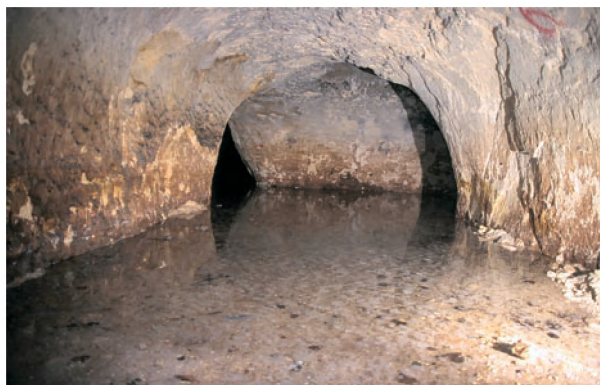
Figure 4: Underground quarry in Meerssen calcarenitic limestone, extracted as soil conditioner, resulting in arched sections. Waterkuil, Vechmaal.

Kanne Horizon, form the sufficiently solid roof for the excavations (Fig. 3). The building stone was dispatched to the southern part of the County of Borgloon (coinciding with the central-southern part of the actual province of Belgian Limbourg), as could be derived from the occurrences of the typical tauw facies among the building stones recorded in monuments. From this same origin, but corroborated by historical documents, most quarrying for building stone must have taken place in the late 13th to 16th centuries. The coarser-grained and irregularly lithified Meerssen Limestone and the lower, flint-bearing part of the Nekum Limestone served as soil conditioner and fertiliser. Galleries carved out in these levels present an arched section (Fig. 4).