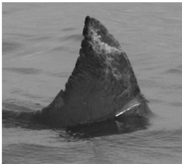
Figure 1a. Active, ulcerated, whitish, velvety lesion (WVL) in Tursiops truncatus PBD015 from Paracas Bay, Peru, on 10 November 2004.