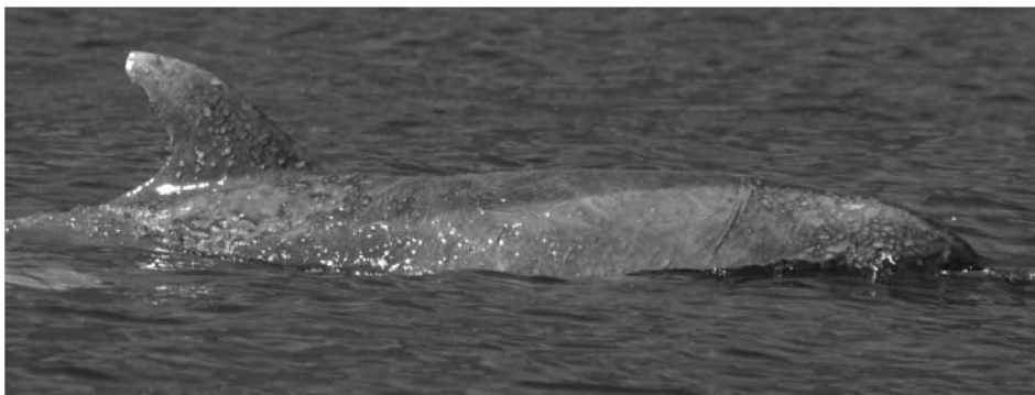
Figure 8a. Vesicular disease in an adult, female Tursiops truncatus from Palena, Chile.