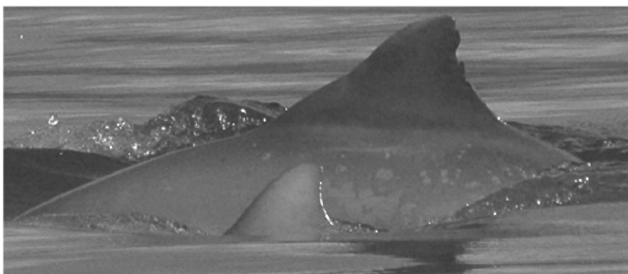
Figure 4a. Fading WVL in Sotalia guianensis 'S' from the Parana Estuary, Brazil, on 27 March 2007.