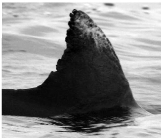
Figure 1c. Recurring WVL in Tursiops truncatus PBD015, from Paracas Bay, Peru, in July 2007.