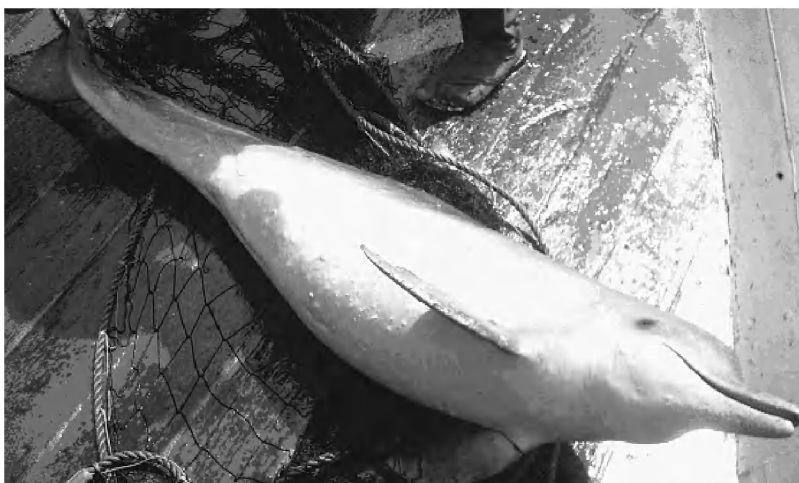
Figure 8b. Vesicles on the body of a Sotalia guianensis captured off the coast of Amapá state, Brazil in November 2008.