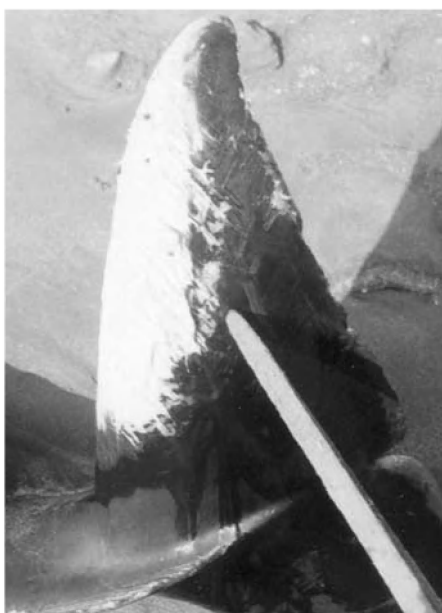
Figure 6. WVL on the tail of a Pseudorca crassidens stranded in Chanduy, Ecuador in November 1992.