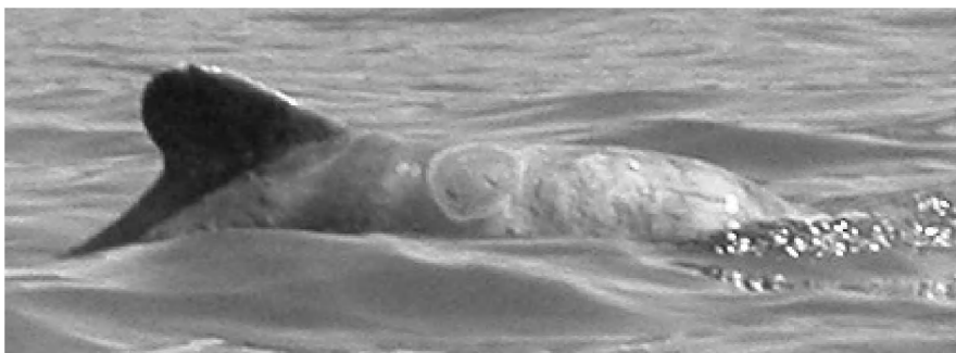
Figure 7b. LRL in a Cephalorhynchus eutropia calf from northern Patagonia, Chile, in January 2003.