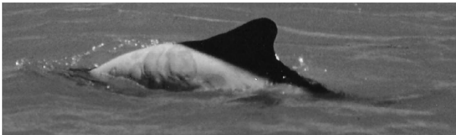
Figure 7a. Large rounded lesions (LRL) in a Cephalorhynchus commersonii from Puerto Deseado, Argentina in October 2001.