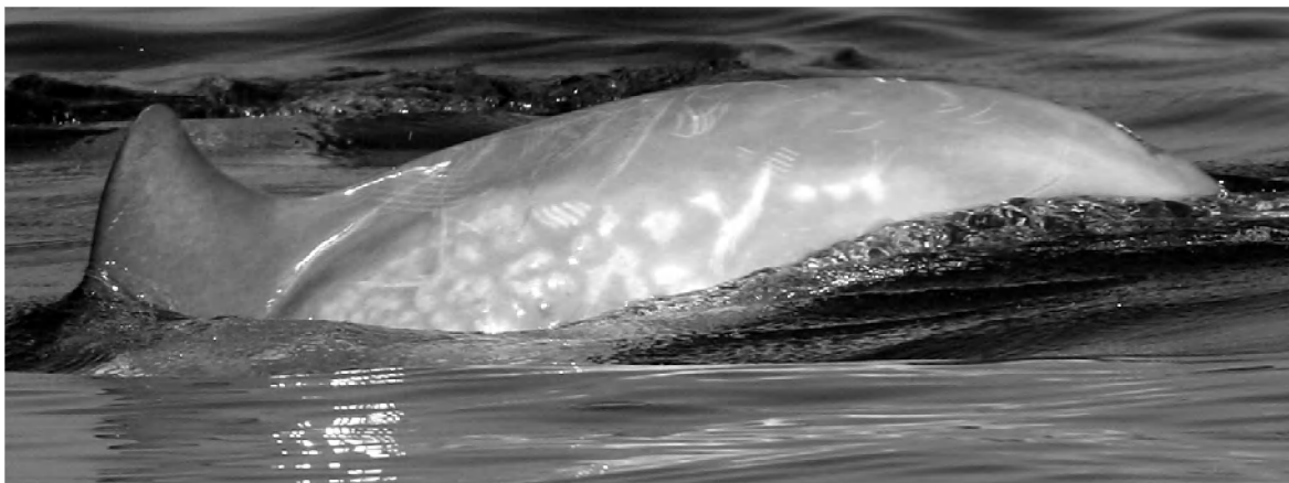
Figure 2a. Active WVL in Sotalia guianensis SEP-33, from Sepetiba Bay, Brazil, on First July 2005.