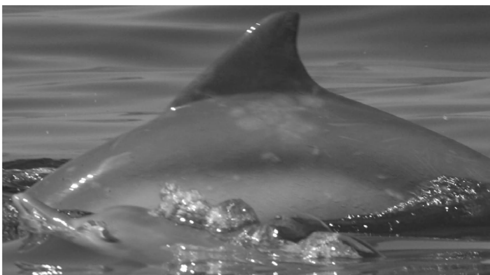
Figure 3b. Faded WVL in Sotalia guianensis from Sepetiba Bay, Brazil, on 4 March 2008.