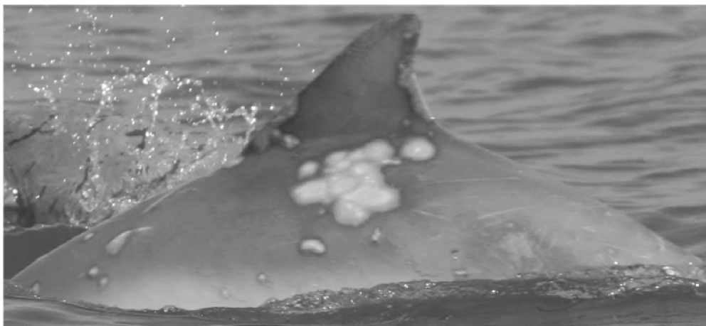
Figure 3a. Active WVL in Sotalia guianensis , Sepetiba Bay, Brazil, on 28 October 2007.