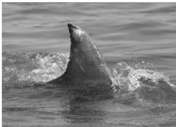
Figure 1b. Healed WVL in Tursiops truncatus PBD015, from Paracas Bay, Peru, on 18 January 2005.