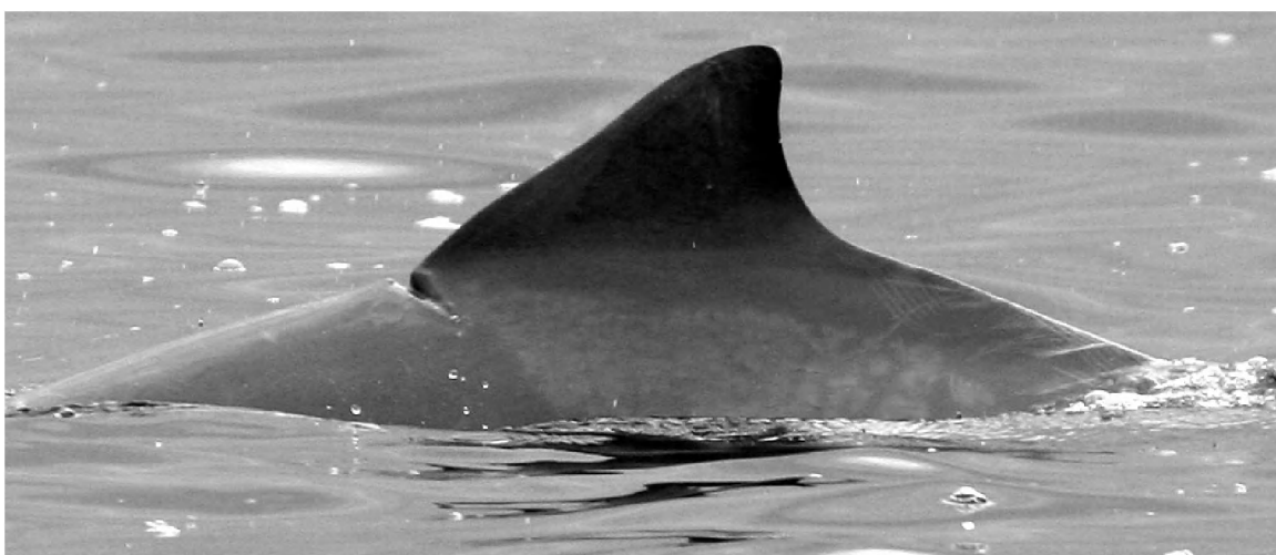
Figure 2b. Fading WVL in Sotalia guianensis SEP-33 from Sepetiba Bay, Brazil, on 29 December 2005.