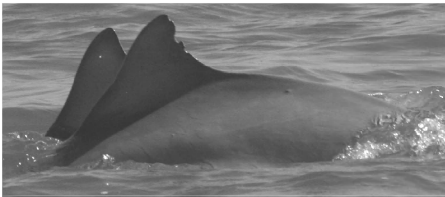
Figure 4b. The WVL have disappeared in Sotalia guianensis 'S' from the Parana estuary, Brazil, on 2 August 2007.