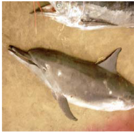
Fig. 4. Panropical spinner dolphin, Stenella longirostris longirostris , encountered at Axim in 2000. Diagnostic characters include the very elongated rostrum, dark-tipped dorsally, triangular and pointed dorsal fin, small flippers and the three-partite patterned body (dark cape, grey lateral field, white ventral field).

Distribution and natural history. Three other specimens are documented from the region. These include a specimen from La Côte d'Ivoire (van Bree, 1971), a skull (CBL 414 mm) from a 188-cm female, archived at the US National History Museum (USNM470557) and examined by Van Waerebeck on 14 May 1999, which originated from Abidjan, La Côte d'Ivoire, and another skull from Liberia curated at the Leiden Natural History Museum (Broekema, 1983). S. longirostris , typically wide-ranging oceanic dolphins, are likely to occur throughout deeper waters of the eastern tropical Atlantic. Weir (2007) reported sightings in deep pelagic areas off Angola.