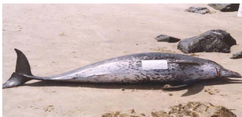
Fig. 6. Atlantic spotted dolphin, Stenella frontalis , offered for sale on Dixcove's landing beach on 3 Jan 2003. Large black spots on a white ventral field and a sturdy, middle-sized rostrum are characteristic.

Earliest documented records. The earliest authenticated report of an Atlantic spotted dolphin in Ghana was a juvenile of 175 cm landed at Dixcove on 19 June 2000. Its skull is curated at UOG (20/01A). A second freshly captured specimen was photographed (Fig. 6) on the Dixcove landing beach on 3 January 2003.