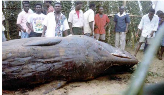
Fig. 17. A sperm whale, Physeter macrocephalus , stranded at Accra in Jul 1997 is the focus of a customary burial ceremony performed by local fishermen. Several (but not all) coastal communities in Ghana, Togo and Benin traditionally venerate whales and other cetaceans.

Earliest documented record. A sperm whale of some 7–9 m length (estimated from relative size of humans in photo) stranded at Osu beach, Accra, in July 1994 (Fig. 17). The cause of death was unknown and the only voucher data are three photographs. A second sperm whale, a decomposed shark-damaged carcass, stranded at Dixcove at an indeterminate date in 2002, is also supported by photographs. Both whales were of unknown sex.