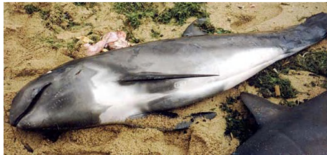
Fig. 9. Risso's dolphin, Grampus griseus , calf at the Dixcove landing beach on 16 Jun 2000. Its flukes had been severed before landing and it was cut in four pieces and sold on the spot.

Earliest documented records. Fanti fishermen have long been familiar with the Risso's dolphin and call it Eko tui (parrot dolphin). One of the authors (Debrah) sampled a juvenile male Risso's dolphin (99/05) at Apam on 4 Nov 1999. On 16 June 2000, Van Waerebeek and Ofori Danson examined another juvenile male (20/00A) of ca. 2 m length landed at Dixcove (Fig. 9), together with yellowfin tuna ( Thunnus albacares ), skipjack ( Euthynnus pelamis ) and indeterminate billfish. Reportedly entangled in a gillnet, it was possibly killed after the net was hauled (deep piercing wound was visible below auditory meatus). The animal carried no phoronts or ectoparasites but its head (collected) showed circular squid sucker scars, suggesting it had at least attempted to prey on squid. A third specimen, pictured in Ofori-Danson et al. (2003), was landed at Axim on 2 Nov 2000.