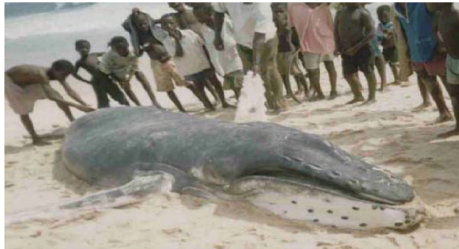
Fig. 18. An emaciated neonate humpback whale stranded at Ada, eastern Ghana, in Sept 1997. Photographed when freshly dead, it is unclear whether the animal died on the beach. Ghana's coast forms part of the distribution range of a 'Gulf of Guinea' breeding stock, whose calving seasonality and exclusive presence in austral winter months firmly points toward a Southern Hemisphere population.

Distribution and natural history. Rasmussen et al. (2007) encountered several humpback whale pods (fluke photo-ID taken for two individuals) including a mother and possible newborn calf in Ghanaian waters between 04° 02.676" N, 01° 56.015" W and 04° 54.402" N, 00° 35.895" W on 1 and 2 Oct 2006. Considering the exclusive presence of humpback whales from early August till late November, and the frequent observations of neonates and 'competitive groups' (Clapham, 2002), it is evident that the continental shelf of Benin, Togo, Ghana, and western Nigeria hosts a breeding/calving population with a Southern Hemisphere seasonality (Van Waerebeek et al. , 2001) for which the authors propose the name 'Gulf of Guinea stock'. Its parapatric distribution suggests it may be related to the IWC-defined breeding stock 'B' from central-west Africa (IWC, 1998, 2006). Mother/calf pairs have been sighted exclusively nearshore in Benin, sometimes just beyond the surf-zone. The westernmost authenticated record is a stranding at Assini Mafia (05° 7'25" N, 03° 16'40" W), eastern La Côte d'Ivoire, on 26 Aug 2007 (Van Waerebeek et al. , 2007).