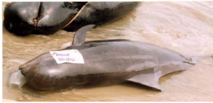
Fig. 12. A calf and an adult short-finned pilot whale, Globicephala macrorhynchus , hauled out at the Dixcove landing beach on 16 Mar 2002.

Distribution and natural history. To the west, G. macrorhynchus is reported from La Côte d'Ivoire waters, authenticated by photographs (figures. 67–68, in Cadenat, 1959). A 312-cm sexually immature female (the smallest individual from a large group) was taken some 8 nm south of Vridi, on 16 May 1958. Its stomach contained remains of unidentified squid and fish. Other cursory reports relate to unidentified pilot whales in the region. 'Globicéphales' were sighted off Abidjan in Dec 1957 and April and May 1958, but details are lacking (Cadenat, 1959). Pilot whales, Globicephala macro-rhynchus ? from near Cap Lopez, Gabon (J. Rouzaud, pers. comm. in Walsh et al. , 2000) also cannot be verified. All six specimens examined occurred between March–June. Fraser (1950ab) first summarized the morphology of G. macrorhynchus in NW Africa. Distribution boundaries to the south and southeast are unclear. On South Africa's Atlantic coast the cool-water-adapted long-finned pilot whale, G. melas edwardii , are found but no short-finned pilot whales have been recorded (van Bree et al. , 1978; Findlay et al. , 1992).