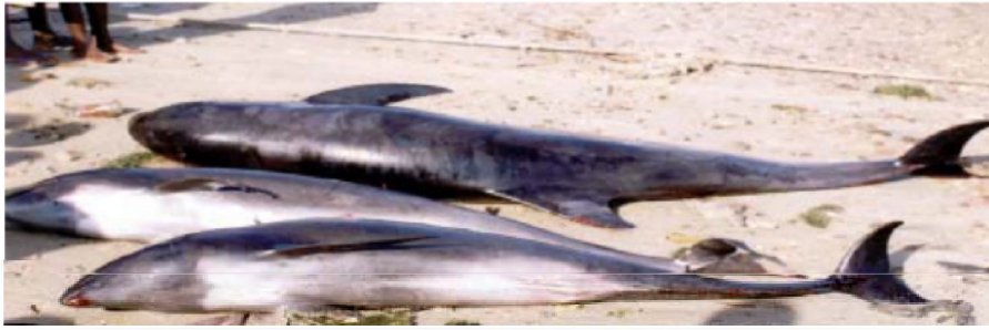
Fig. 10. Three melon-headed whales, Peponocephala electra , landed at Dixcove on 22 Jun 2000. The markedly triangular head-shape (in dorsal view), very pointed flippers, a slender tailstock, an indication of a very short beak (visible in the animal at the forefront) and a higher tooththrow count (20–25) distinguishes this species from the pygmy killer whale.

Distribution and natural history. P. electra is known in the Gulf solely from bycatches in Ghana. Geographically, adjacent records are, to the northwest, a skull from Guinea-Bissau (van Bree & Cadenat, 1968) and to the south, three sightings off Angola in deep oceanic waters (Weir, 2007) plus a stranding at Hout Bay (34° 03' S, 18° 21' E), South Africa (Best & Shaughnessy, 1981). Nonetheless, P. electra may be widely distributed in the eastern tropical Atlantic. Length at birth is reported as ca. 1 m (Jefferson & Barros, 1997), but the '122 cm' calf from Shama showed 4–5 vertical creases on its flanks, suggestive of foetal folds as from a recent birth. Uncertainty exists though, whether standard length had been taken or body length had been overestimated, by measuring over the body curvature. The Shama female showed swollen mammary slits consistent with lactation, hence it seemed safe to conclude that a mother/calf pair was involved. Female sexual maturity is reached, on average, at 235 cm (Jefferson & Barros, 1997), but this does not account for possible geographic variation.