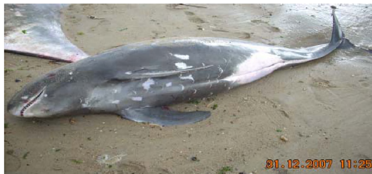
Fig. 11. This adult-sized pygmy killer whale, Feresa attenuata , landed at Dixcove beach on 31 Dec 2007 is the first authenticated record for the Gulf of Guinea. A low count of large, conical teeth and somewhat rounded flipper tips (visible here) sets this species apart from the morphologically similar melon-headed whale.

Earliest documented records. An adult-sized pygmy killer whale (Fig. 11) was landed at Dixcove on 31 Dec 2007 and was photographed by fisheries observer, Amiah Johnson.