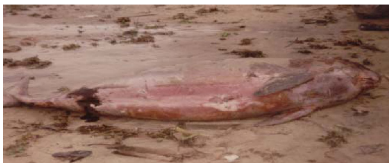
Fig. 16. A dwarf sperm whale, Kogia sima , landed as bycatch at Apam in 1998.

Earliest documented record. Apam fishermen brought ashore a 120-cm dwarf sperm whale calf on 23 Aug 1998 (Fig. 16), the first evidence of this species for Ghana and the Gulf. One of the authors, Debrah, collected the skull for the UOG collection. Despite physical immaturity of the specimen, cranial characteristics including tooth counts (LL9, LR9, UL5, UR5) firmly identify it as K. sima , the only Kogia species that may bear teeth in the upper jaw (Caldwell & Caldwell, 1989). In addition, the closely related pygmy sperm whale, K. breviceps , has more teeth (10–16 pairs) in the lower jaw.