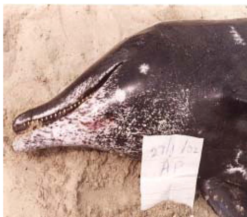
Fig. 8. A rough-toothed dolphin, Steno bredanensis , landed at Apam on 27 Jan 2002. The long-sloping head without melon crease, irregular ventral spotting and large flippers are indicative for this deep-water species.

Earliest documented records. Artisanal fishermen operating from Apam landed two rough-toothed dolphins in late summer 1998 (date indeterminate either 29 Aug or 24 Sept 1, 1998). Photographic evidence (archived in Corewam's Ghana Cetacean Database) shows the unmistakable conical tapering head and the large, pointed flippers. A third specimen, a juvenile, was offered for sale in Apam on 17 Oct 1999 (photos see Debrah, 2000, p. 33; Van Waerebeek et al. , 1999) and a fourth, larger individual (Fig. 8) on 27 Jan 2002, all at Apam. (C. W. Oliver, pers. comm. in Jefferson et al. , 1997) reported two undocumented sightings off Ghana in 1972, which, nonetheless, are considered reliable (W. F. Perrin, pers. comm. to Van Waerebeek).