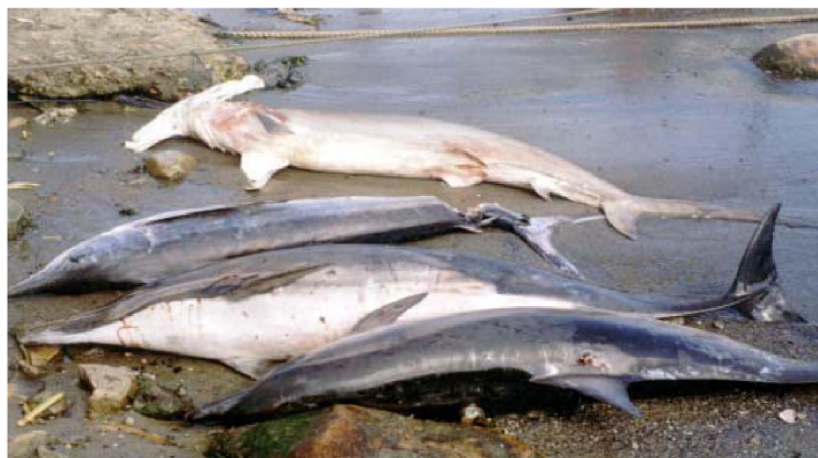
Fig. 7. Two long-beaked common dolphins, Delphinus capensis , landed alongside a smooth hammerhead shark and an unidentified billfish (Istiophoridae) at Dixcove, on 18 Oct 1999. Note the harpoon/lance entry wound at the right side under the dorsal fin of the (lower) dolphin.

Earliest documented records. Fishermen landed two long-beaked common dolphins of adult size at Dixcove on 18 Oct 1999 (Fig. 7), the species' first confirmed record for Ghana. A third specimen was landed at Axim on 19 June 2000, from which the cranially mature skull was obtained (DOF 20/010). Voucher skulls for another three individuals (DOF 20/02, 20/022, 20/023) were collected by the authors. Cranial features diagnostic of D. capensis include a lanceolate- or pseudo-lanceolate-shaped palate ( versus trapezoid shape in D. delphis ; see Van Waerebeek, 1997) and a high ratio (1.70–1.83) of rostrum length to zygomatic width (Heyning & Perrin, 1994; Jefferson & Van Waerebeek, 2002).