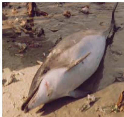
Fig. 3. The Clymene dolphin, Stenella clymene , is the most frequently landed cetacean in Ghana. Shown here is a freshly dead specimen, captured off Winneba.

Earliest documented records. Ghanaian fishermen are most familiar with the Clymene dolphin, sometimes calling it the 'true dolphin' or 'Etsui Papa' because the species is so frequently found entangled in fishing gear. A probable bycatch specimen from Keta (05° 55' N, 00° 59' E) in May 1956 (Prof. Chris Gordon, pers. communication) is the earliest specimen record in the Gulf. The physically mature skeleton is mounted (without number) in the Zoology Department museum at UOG (alveoli counts, 41UL, 42 LL). A second specimen, a 216-cm female, with sharply pointed teeth (38UL, 39LL), was captured off Winneba on 23 September 1998 (Fig. 3). The tripartite body colouration, including a white belly, black eye patch, grey eye-to-flipper stripe, a characteristic dark stripe along the middle of the upper rostrum ending in a black rostrum tip, and fine blackish lip patches were evident (Perrin et al. , 1981). A third, juvenile, specimen (99/03) was landed at Apam on 20 July 1999 (its head was shown as Plate B in Ofori-Danson et al. , 2003). No helminth parasites were found in the cranial sinus system. Since then a total of 13 cranial specimens has been collected from bycatches, now archived at UOG (98/01; 98/02; 98/03; 98/04; 98/05; 98/06; 98/07; 98/09; 98/11; 99/02; 99/03; 20/09B; 20/036).