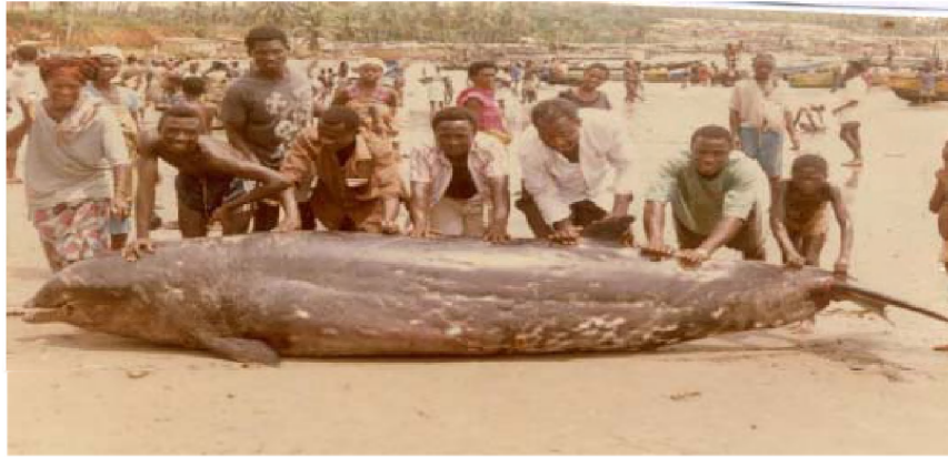
Fig. 15. A juvenile Cuvier's beaked whale, Ziphius cavirostris , landed at Axim in May 1994, the first record of a beaked whale in the Gulf of Guinea. Note the very short beak, the steeply sloped head, robust body and the dorsal fin located at 2/3 distance posteriorly. (Photo courtesy D. Vanderpuje).

Distribution and natural history. Cuvier's beaked whale is a cosmopolitan pelagic species in tropical to warm temperate waters. Weir (2006b) described a group of three Cuvier's beaked whales southwest of Luanda, Angola, at 07° 15.84' S, 11° 07.79' E, and reported a group of 3-4 'likely Cuvier's beaked whales' NW of Luanda. Four other beaked whale sightings off Angola were not identified, but Z. cavirostris was possible in three cases, the fourth was a Mesoplodon sp. All encounters were over deep water seaward of the continental shelf (Weir, 2006b). Three stranded Cuvier's beaked whales are known from Namibia (21°-23° S) and another two from the Atlantic coast of South Africa (Findlay et al. , 1992; Ross & Tietz, 1972).