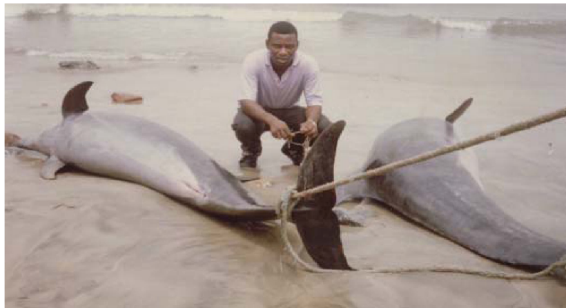
Fig. 2. Two common bottlenose dolphins, Tursiops truncatus , pulled up the beach by artisanal fishermen at Jamestown, near Accra, on 5 Feb 1994.

Earliest documented records. Two freshly captured common bottlenose dolphins were landed by a purse-seiner at Jamestown on 5 February 1994 (Fig. 2). One, a 300-cm male, was necropsied at CSIR and its skull, scapulae, four vertebrae (including atlas and axis), os hyale, partial sternum, one rib, one humerus and ulna, several teeth and a tissue sample (in DMSO) were collected. A second and a third common bottlenose dolphin, of 255 cm and 315 cm length, were brought ashore at Senya Beraku (05° 23' N, 00° 29' W) and Tema, respectively. These dolphins were previously reported but equivocally assigned to Delphinus delphis (Ofori-Danson & Odei, 1997). A calvaria dredged by a fishing boat from an indeterminate site in Ghana's shelf waters, collected by Dr Ofori-Adu sometime before 1998, was identified by KVV at the Tema Research and Utilization Branch of the Fisheries Department (Ministry of Agriculture).