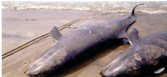
Fig. 14. Two false killer whales, Pseudorca crassidens , landed at Apam in 2003. Combined, the rounded head, almost entirely black colouration, curved flipper shape and the dorsal fin positioned slightly behind mid-back are diagnostic.

Earliest documented records. Three false killer whales were landed as bycatch at Apam, i.e. two adults on an unspecified date in 2003 (Fig. 14) and a 197-cm juvenile (photo archived) on 24 Sept 2003. The species' presence in Ghana is here documented for the first time.