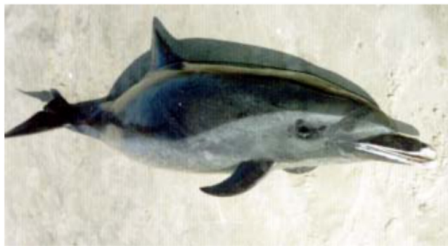
Fig. 5. A fresh pantropical spotted dolphin, Stenella attenuate , landed by Apam fishermen in 1998. Note the brilliant white lips and tip contrasting with an otherwise dark rostrum, the prominent dark cape dipping low onto sides forward of the dorsal fin, grey lateral and ventral fields (with moderate, white spotting), and smallish dark pectoral fins. The gape to flipper stripe is muted in this individual.

Distribution and natural history. In the wider study region, the pantropical spotted dolphin has been documented from La Côte d'Ivoire (Cadenat & Lassarat, 1959b; van Bree, 1971), Gabon (Fraser, 1950a) and offshore waters of the eastern tropical Atlantic (Perrin et al. , 1987). An earlier reference for Ghana (C. W. Oliver, pers. comm. in Jefferson et al. , 1997) is not supported by voucher data, but Chuck Oliver, a trained dolphin/tuna observer at the Southwest Fisheries Science Center, La Jolla, California, is considered a trusted source (William F. Perrin, pers. comm.). No records exist from the Atlantic coast of South Africa (Findlay et al. , 1992).