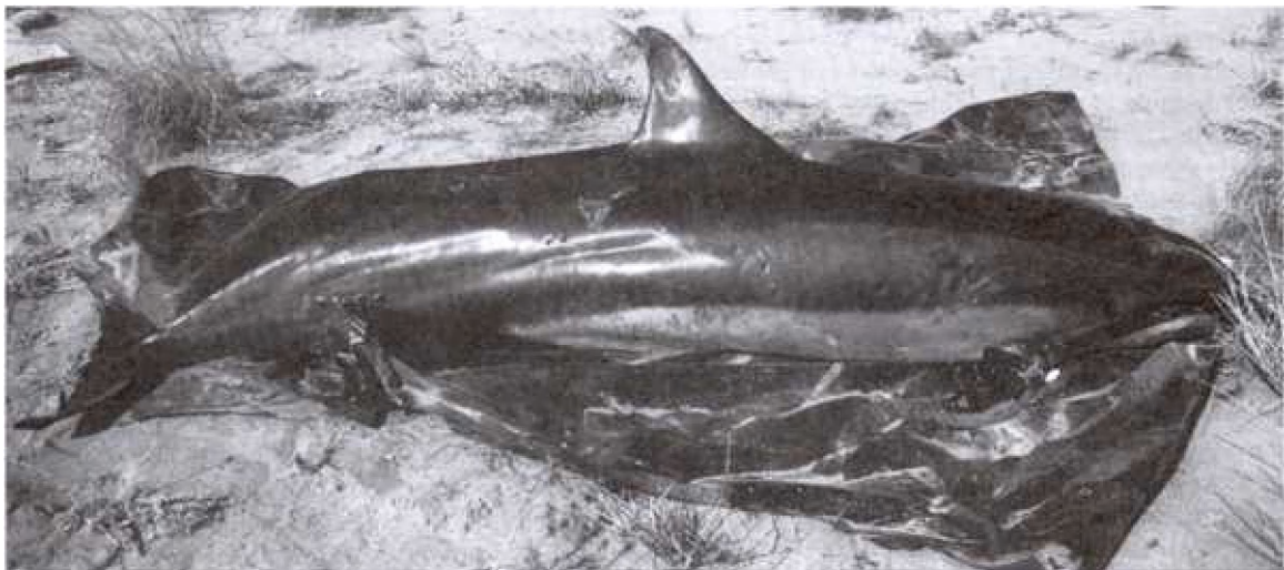
Fig. 1. 169cm male spinner dolphin (ONHM2121) collected by Baldwin on beach, Intercontinental Hotel, Muscat (23°37'N, 58°28'E), Oman, 30 December 1992. Chosen as the CM1 'type' specimen for its clear tripartite pattern, prominent cape and falcate dorsal fin, which identifies it as a pantropical spinner dolphin. Freshly dead, the animal presented cutmarks of nets across the tailstock. Despite its small size, all vertebral epiphyses and cranial sutures were fully fused, evidence of physical maturity.

The melon-headed whale is a mid-sized, pelagic delphinid which occurs throughout the world in tropical and subtropical seas (reviewed by Klinowska, 1991; Mikkelsen and Sheldrick, 1992; Jefferson et al. , 1993; Perryman et al. , 1994). Coastal surveys of beaches and fishing ports, and shipboard surveys of offshore waters of the Arabian Sea have not yielded any confirmed report of this species (see