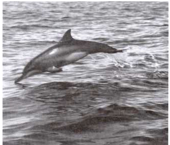
Fig. 3. Smaller than CM1, the CM2 morph is characterised by a dark dorsal overlay obscuring most of the tripartite pattern evident in CM1. Typical pinkish ventral field and supragenital patch (which may also be white) is clearly visible in the colour original of this photograph by Baldwin near Fahal Island (23°41'N, 58°31'E), Oman, March 1990.