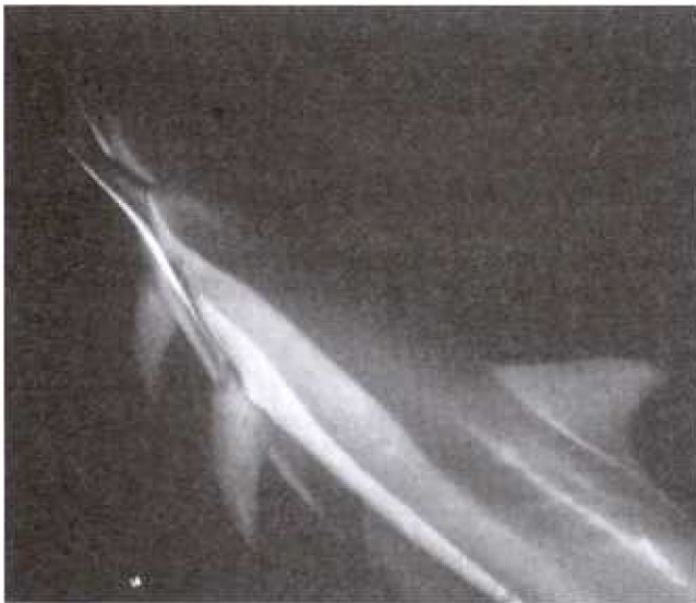
Fig. 2. Two CM1 type spinner dolphins, the most commonly encountered morph off Oman, photographed near Fahal Island (23°40'N, 58°32'E), Oman, April 1990. Tripartite colouration is characteristic of pantropical spinner dolphin with prominent dorsal cape descending low on flanks and anterior portion of ventral field extending dorsally to behind eye.