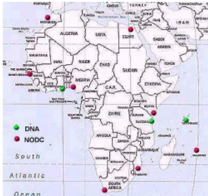
Figure 1: Data Centres in Africa