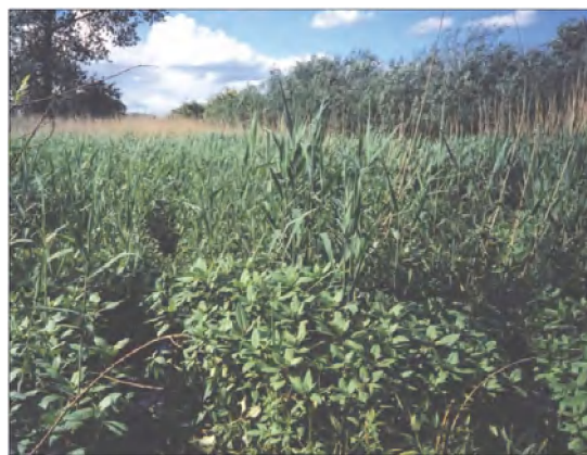
Fig. E-3.1: A typical Phragmites australis -dominated tidal freshwater marsh (Scheldt estuary, Belgium).