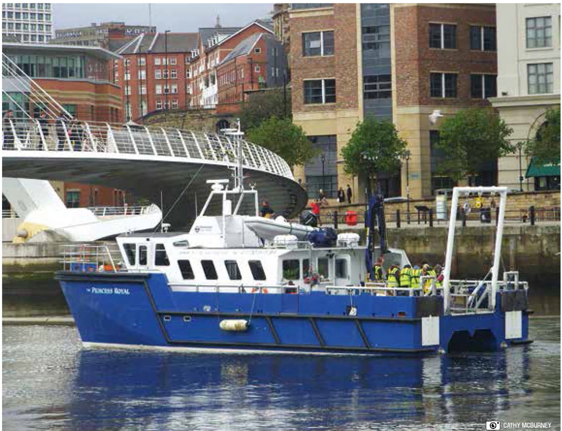
The RV Princess Royal is a coastal research catamaran owned by Newcastle University (United Kingdom) and is more power efficient than conventional designs. The hull, rudder and propellers have been fully optimized to keep fuel consumption and thus engine exhausts low while enhancing sea keeping and speed potential.

Choosing the proper propeller/rudder system improves propulsive efficiency. The retrofit of a better propeller design can greatly aid in fuel consumption decrease. Reblading propellers has been reported to reduce fuel consumption on average by about 10%. Novel propeller designs like the contracted loaded tip (CLT) and counter rotating propellers or boss cap fins have documented important power savings.