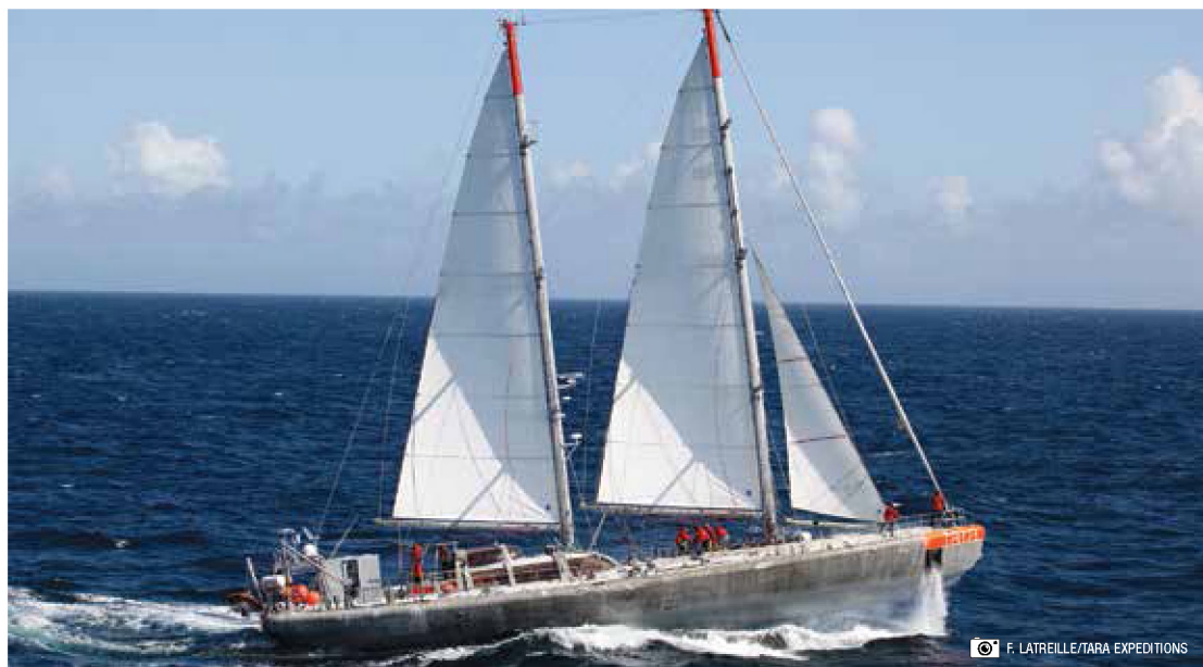
Sails are a viable option for research vessels without compromising the research capacity and performance while dramatically reducing environmental impact and operational costs. Shown here is the French-owned RV Tara .

Simply applying whatever sweep of green technologies on board a vessel does not suffice. Creating environmental awareness among shore staff and crew by continued training and follow-up is paramount to achieving a greener ship.