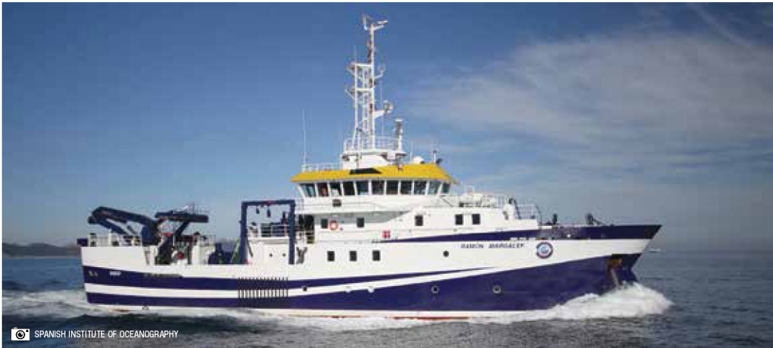
The RV Ramón Margalef is the new research vessel of the Spanish Institute of Oceanography. The vessel uses biocide-free silicon hull paints, ozone treatment of ballast water, and bio-hydraulic oils; sails in a silent mode; houses a power management system; and carries a clean ship notation.

The major classification bureaus issue Green Class notations. International standards such as ISO9001, the ISO14001 and the International Safety Management Code include environmental management systems for use on board vessels. Other “environmental awareness labels” (e.g., Der Blaue Engel [Blue Angel]) may also be applied to vessels and/or operators and help in maintaining a high level of environmentally friendly operations.