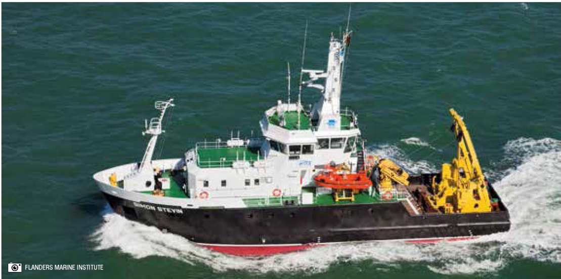
The RV Simon Stevin is the new build coastal multi-purpose research ship of the Flanders Marine Institute, Belgium. The ship carries an active anti-fouling system and a silicone based hull paint, uses waste heat recuperation, has a low noise profile, burns low sulphur fuel, and carries the ISO14001 accreditation.

The concept of pumping air under a hull to reduce drag is implemented on a small number of large merchant ships. Results from existing projects demonstrate its potential and designers claim a maximum of 15% reduction in fuel consumption. As air bubbles block signals of acoustic equipment, the application of such technology on board research vessels can be limited during transit. The technology also is only effective on longer ships, thereby excluding usage on smaller research vessels.