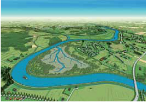
Figure 0.2. Bergenmeersen at low tide