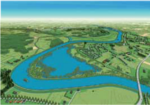
Figure 0.4. Bergenmeersen at spring tide