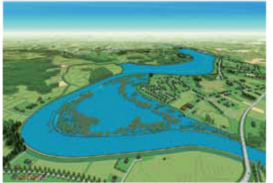
Figure 0.5. Bergenmeersen at storm tide