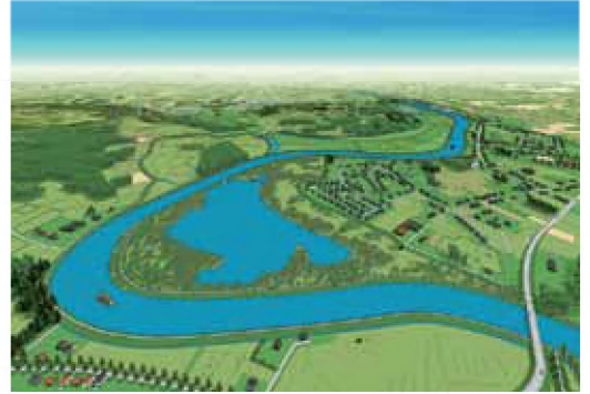
Figure 0.3. Bergenmeersen at high tide