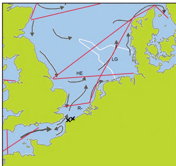
Fig. 1. Continuous Plankton Recorder (CPR) routes in the North Sea and English Channel in 2011 (straight lines), boundary of the German exclusive economic zone (white) and main flows in the North Sea, Atlantic inflow omitted, modified from Makinson & Daskalov (2007), after OSPAR Commission (2000) (black arrows). The CPR routes mentioned in the text are labelled (HE, LG and R-). The positions of the first records of Pseudodiaptomus marinus in the North Sea (Brylinski et al. , 2012) are indicated by black crosses.

06°29'56.4"E) on 6 November 2011 at 15:37 UTC, just before sunset. Sixty-seven specimens of P. marinus were taken: 15 males, 10 females and 42 copepodites, representing abundances of 0.05, 0.03 and 0.13 ind m^{-3} .