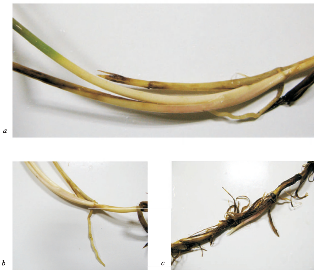
Fig. 2. Leymus racemosus subsp. sabulosus : a) 7-day growth of stems; b) 7-day growth of root sprouts; c) Ammophila arenaria vegetative shoot (after 7 days)