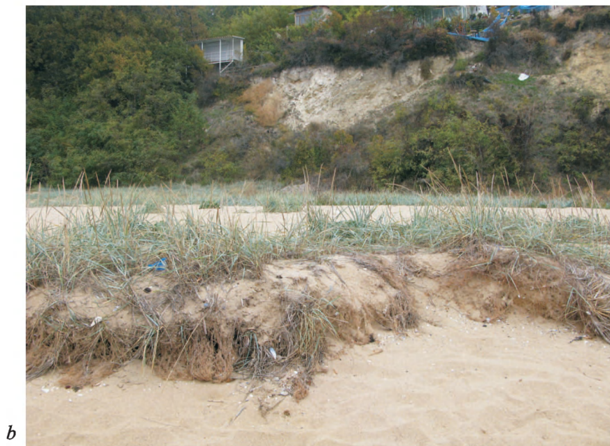
Fig. 1. Leymus racemosus subsp. sabulosus and Ammophila arenaria communities along Panorama beach: a ) after the storm in March 2010; b ) two month after the storm