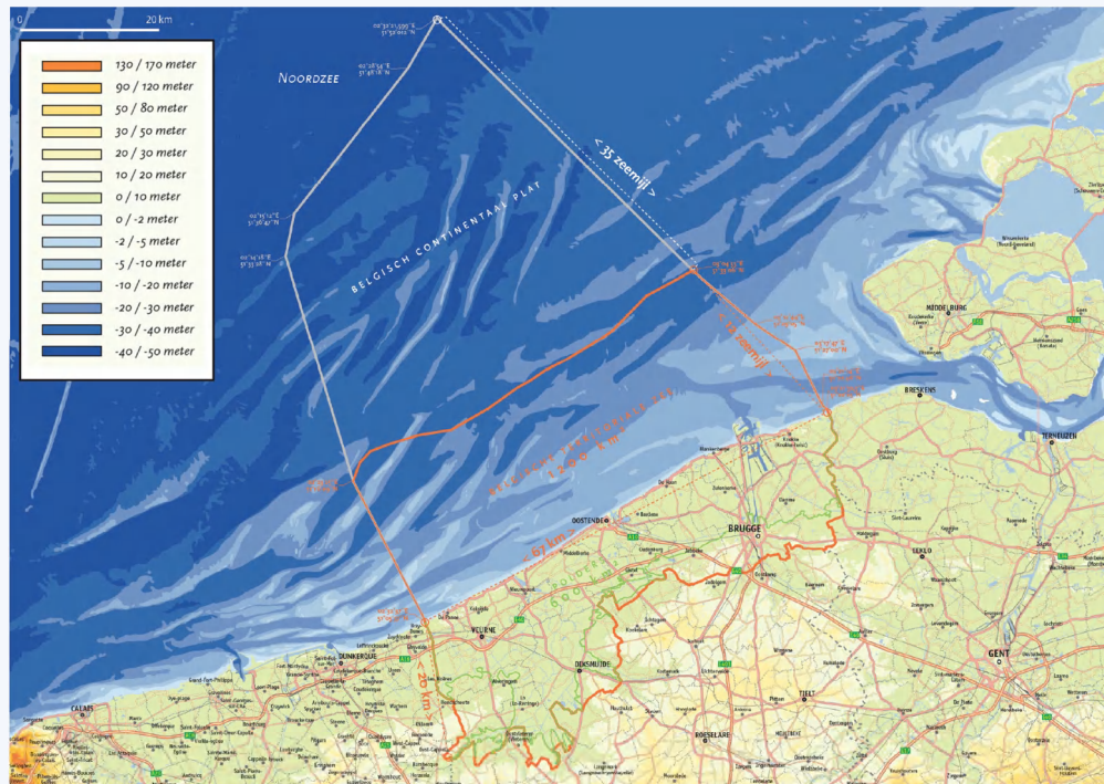
Figure 1. Demarcation of the coastal area, as defined by the Coordination Centre for Integrated Coastal Zone Management in Belgium, showing the 12-mile zone at sea and the 10 coastal municipalities and 9 hinterland municipalities on the landward side of the 'coastal zone' ( www.coastalatlus.be ).

The issues for integrated coastal zone management in Belgium are partly addressed in the following publications: Tussen Land en Zee: dringend... nood aan een integraal kustzonebeheer: 10-puntenprogramma voor integraal kustzonebeheer in België (Natuurreservaten vzw en WWF 1994) 19104 , Belpaeme 2001 22507 , Advies van de Mina-raad van 5 april 2001 over het geïntegreerd beheer van kustgebieden 66206 and Cliquet et al. 2002 30285 (Legal inventory of the coastal zone in Belgium).