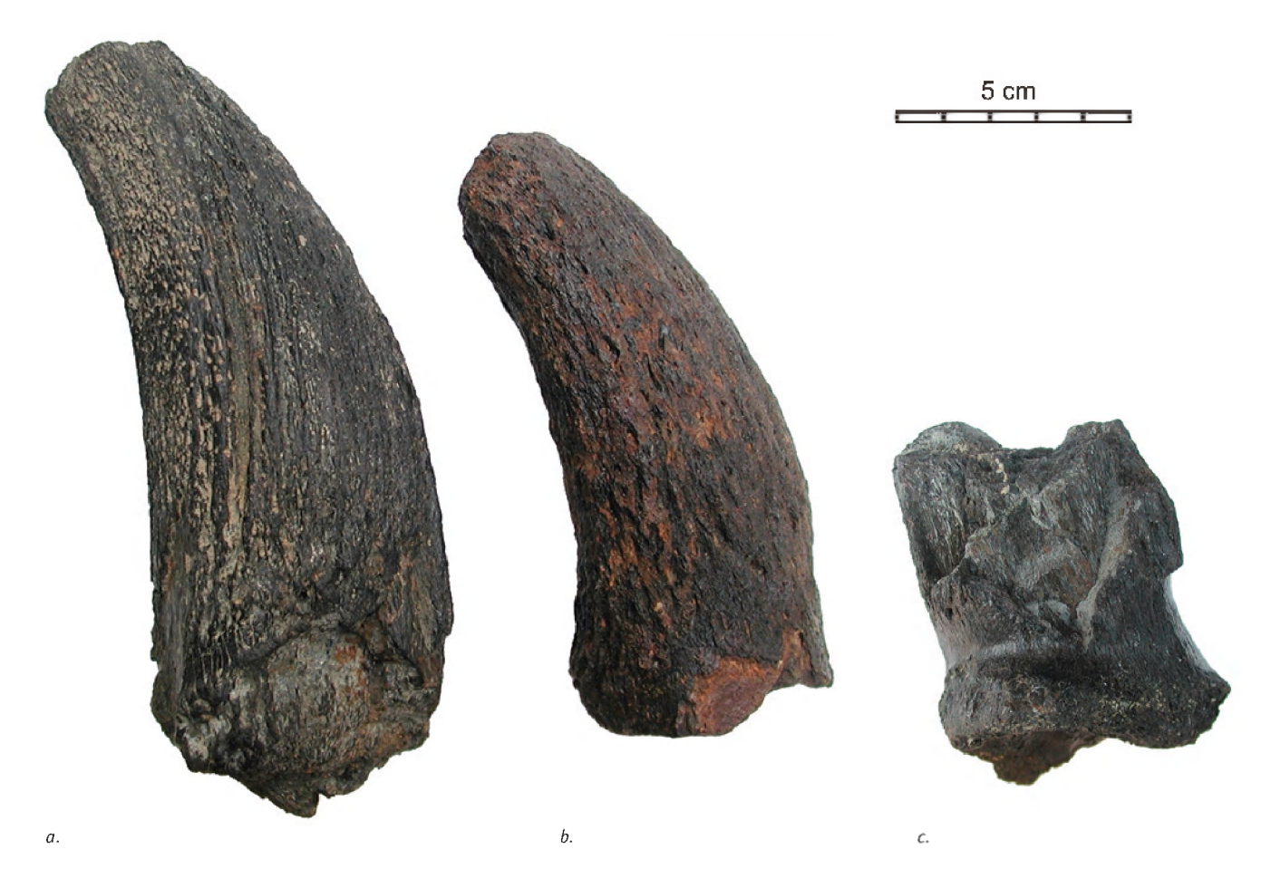
Fig. 3. As in Fig. 2, but posterior side.

The horn core is flattened and has an anterior keel, resulting in a pointed oval in cross-section. The surface is rugged and shows several deep, longitudinal, grooves passing upwards towards the outer edge of the anterior side. The posterior side has three deep grooves, the most anterior one ending at the keel. The pedicle is short and smooth.