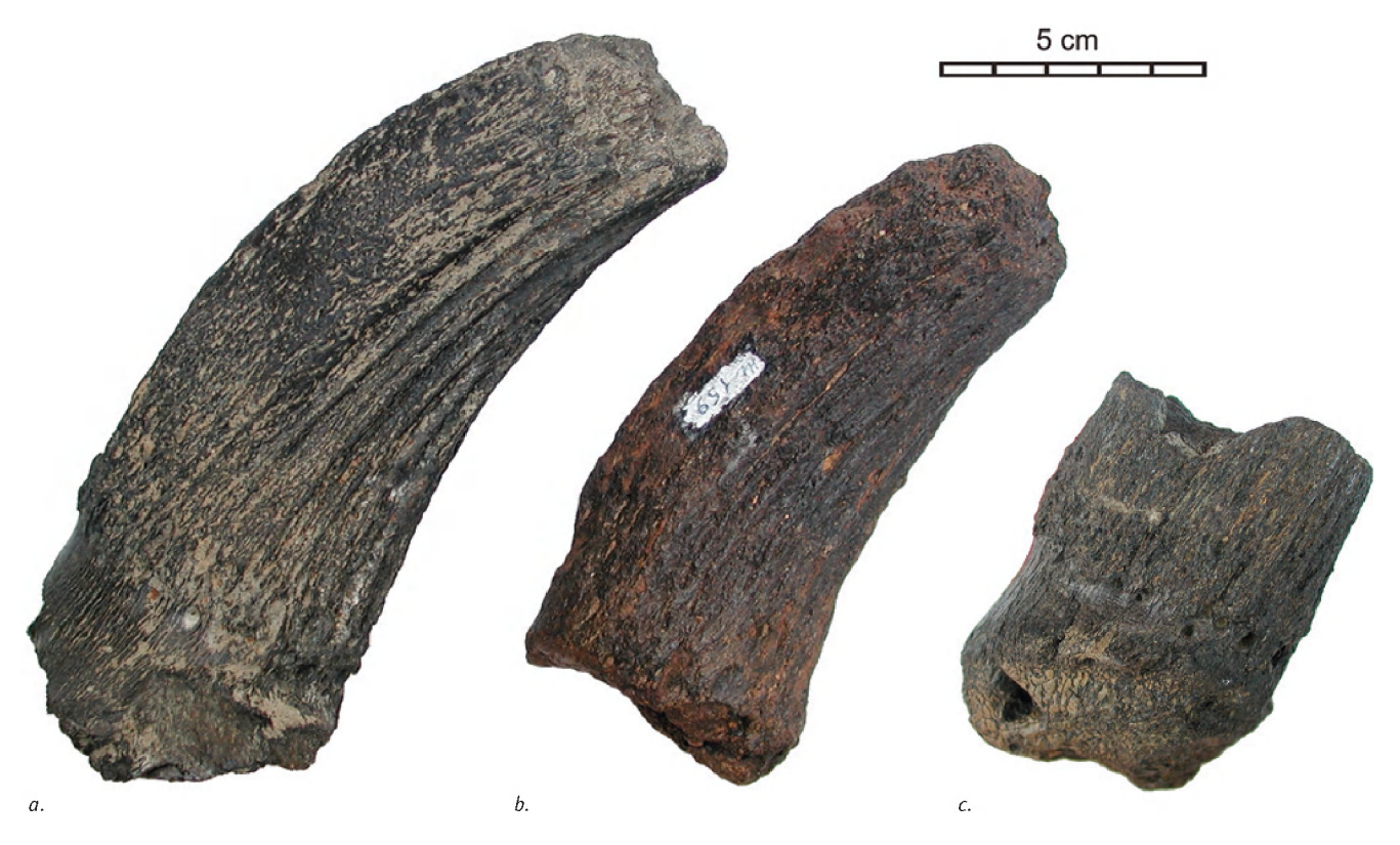
Fig. 2. Horn cores of Caprovis savinii – anterior side; a. left horn core with part of the pedicle, frontal and orbit (St. 450761); b. left horn core (St. 450765); c. basal fragment of a left horn core with part of the pedicle and frontal (St. 450766).

Specimen St. 450761 is a nearly complete left horn core, with part of the pedicle, frontal and orbit preserved, which makes it possible to reconstruct a vertical implantation on the skull, with an outward and backward bending. The distal end is broken off. The horn core exhibits a slow anticlockwise torsion. It is important to notice that the term torsion is used here to indicate that the axis of twisting stays within the bone. When the axis becomes tangential or external to the surface of the bone, the horn core is described as spiralled.