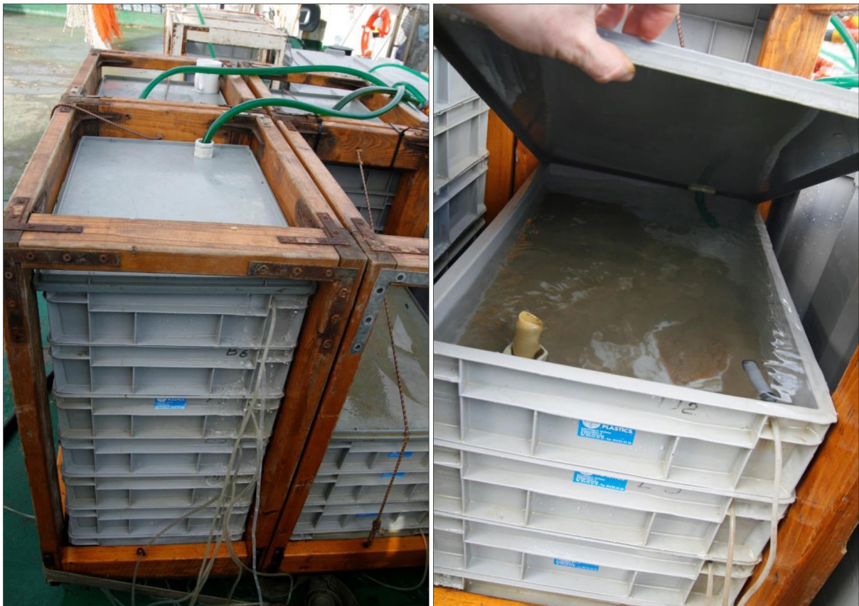
Figure 5 – Holding facilities were supplied with a continuous flow of sea water. Two individuals were accommodated in each of the tank: 1 plaice and 1 sole, enabling easy identification of the individuals.