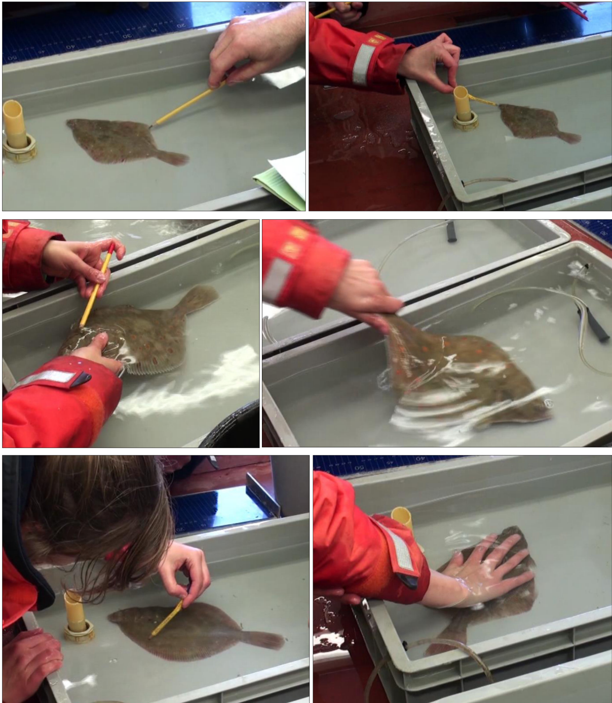
Figure 3 – illustration of retained and unretained reflexes (from left to right and top to bottom): (1) if stabilisation of the fish on the bottom is not apparent, the fins were lifted. However, this was only the case in the development of this reflex and not needed for the actual calibration test. It might therefore be eliminated from the description of this test, (2) mouth, (3) operculum (should be tested under water in contrast to what the picture shows), (4) the tail was grabbed and lifted out of the water. Generally the tail is only touched a little bit in contrast to what the picture shows, (5) brushing of the fins did not lead to a clear reflex, (6) resistance of the fish to pressure did not lead to a clear response.