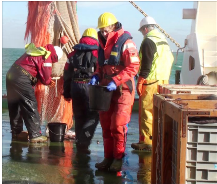
Figure 4 – Collection of fish in a favourable condition from short beam trawl hauls on-board the RV Belgica. Fish were directly transferred to buckets with sea water to minimize stress.

The tested individuals of sole and plaice in the calibration tests (Table 7; Table 8) were accommodated in holding tanks (Figure 5). Hauls were similarly short (<20min) as the “reference hauls” in Depestele et al. (, 2014), which indicated high survival and were used as control for the holding tanks. The beam trawl used (8m beam width) had a double codend of 40mm mesh size. Fish were collected from the codend and directly transferred to buckets filled with sea water in order to minimize air exposure and stress. Reflexes were evaluated at the sorting table. Only fish that were in apparently perfect condition, based on subjective vitality scoring by the observers, were selected for the tests.