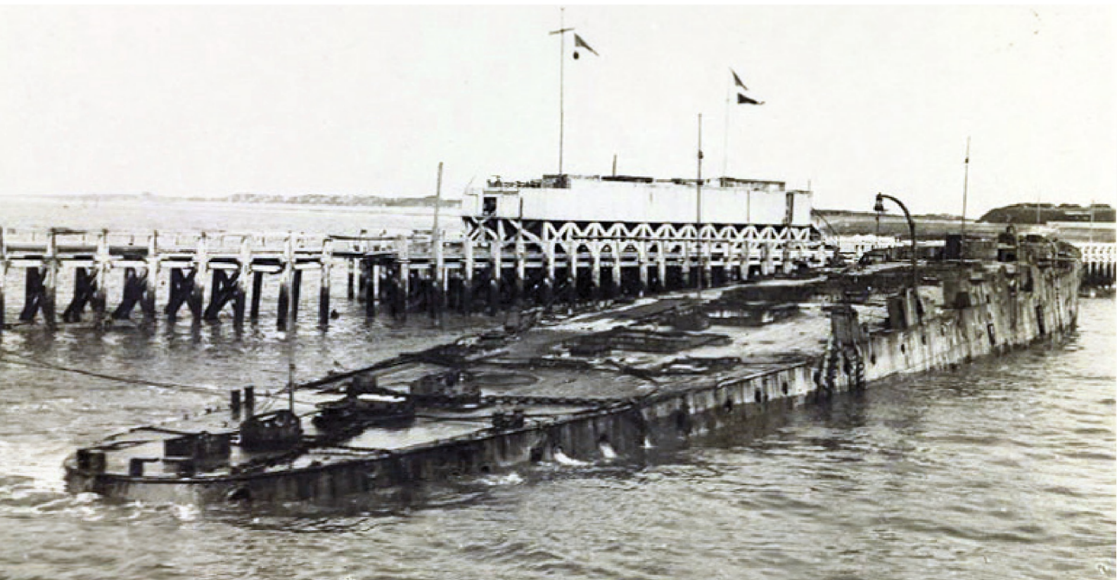
■ The sunken Vindictive against the Ostend pier