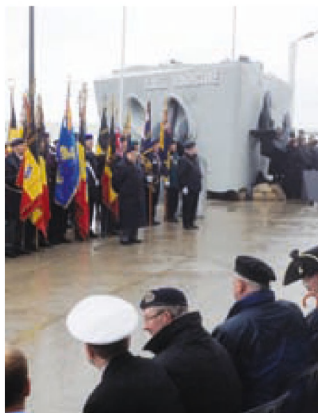
■ Top: the Vindictive memorial in Ostend has recently been moved (Tolhuis Provincial Library). Bottom: the bow of HMS Vindictive at the new location near the Oosterstaketsel pier in Ostend during the solemn inauguration on 24 May 2013 (Marnix Pieters, Flanders Heritage Agency)