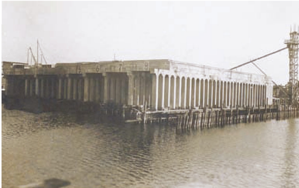
■ To protect their U-boats, the Germans built a U-boat bunker in the Bruges harbour. It was demolished in the 1950s

The Belgian ports of Zeebrugge and Ostend posed a serious threat to the Allied forces during the First World War. Their location, near the mouth of the Scheldt and the English Channel, would make these ports the best-situated operating bases for the German U-boat and torpedo boat fleet. Moreover, Bruges was connected to both Zeebrugge and Ostend via a canal. This way a good hiding place for the vessels of Marinekorps Flandern could be developed out of range of the British guns. During the war, German ships operating from these Belgian ports were responsible for one third of the tons of shipping lost by the Allies. At the same time, connections across the Channel were essential to the Allies, not just as a supply line to bring in fresh troops but also for communication and the provisioning of the British Isles. In response to the German naval threat, the British Dover Patrol tried to block the ports of Zeebrugge and Ostend in the night of 22 to 23 April as well as the night of 9 to 10 May 1918.