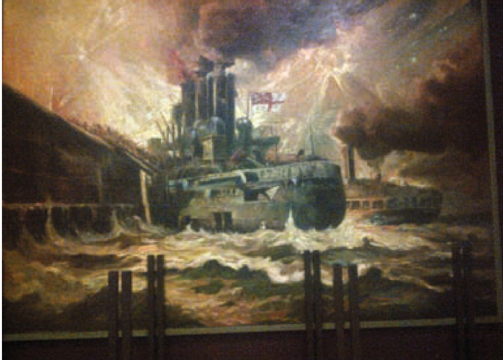
■ This painting in Zeebrugge Community Centre depicts the Zeebrugge raid in a dramatic manner

These arguments were refuted one by one, however. The British blockade of German battleships prevented them from moving freely to attack convoys. The loss of efficiency and time turned out to be greater when a ship was sunk. And timely notice prior to the arrival of a convoy ensured that the port in question could prepare for unloading the ships. Convoys were gradually introduced and with success. Several new techniques also showed great promise. In late 1917 the British developed ASDIC, the world's first active sonar technology. This apparatus emits acoustic pulses which reflect off submerged objects and these echoes are then received by the apparatus. The apparatus determines the depth (distance) of an object by measuring the time between emitting and receiving a pulse. The First World War also saw the development of the depth charge, designed for detonation at a preset depth. Sonar and the depth charge would both turn out to be very powerful anti-submarine weapons.