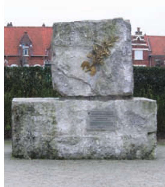
■ Left: the original monument on the corner of De Maerelaan and Zeedijk in Zeebrugge was pulled down during the Second World War and taken to Germany. The current monument dates from 1984. Right: fragments of the mole with which HMS Vindictive collided, now located on Admiraal Keyesplein in Zeebrugge (Tolhuis Provincial Library)