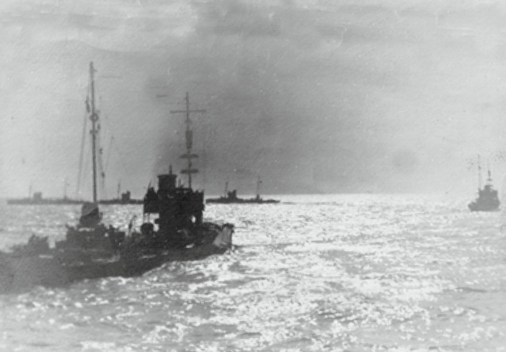
■ A few German torpedo boats of the Flanders Flotilla heading for the English coast

Zeebrugge and Ostend could then be useful for supplying the Allied troops. The Germans also considered these ports to be only a temporary stopover. Zeebrugge and Ostend had fallen into German hands relatively intact, but no defences were present and the ports were not equipped for mooring, repairing and maintaining a war fleet.