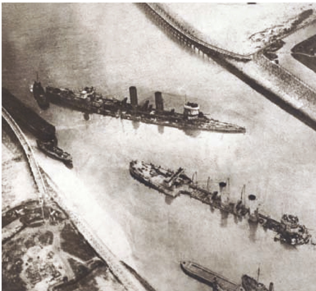
■ Position of the blockships HMS Iphigenia and HMS Intrepid in Zeebrugge harbour after the raid

Just before midnight a sudden gust of wind blew away the smoke screen. The contours of HMS Vindictive were now clearly visible. The German batteries were in combat readiness and opened fire. By the time HMS Vindictive had reached its position alongside the mole, most of the gangplanks specially