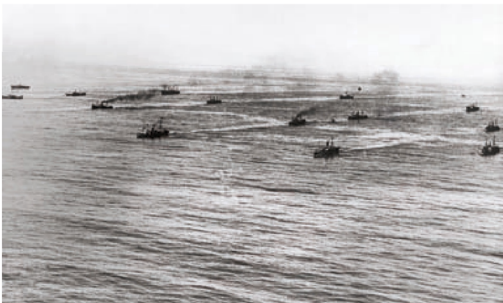
■ A British convoy of the Royal Navy zigzags through a danger area in the Atlantic Ocean

Vice-Admiral Roger Keyes did not just plan and lead the Zeebrugge and Ostend raids, he also took numerous other measures to hinder German shipping in the English Channel. For instance, he had additional anti-submarine nets with mines installed and introduced search-and-destroy patrols. U-boats were then faced with the risk of being sunk by the patrols or getting entangled in mine nets. All these measures and circumstances made it increasingly difficult for the German submarines and torpedo boats in the Channel to disrupt Allied supply lines.