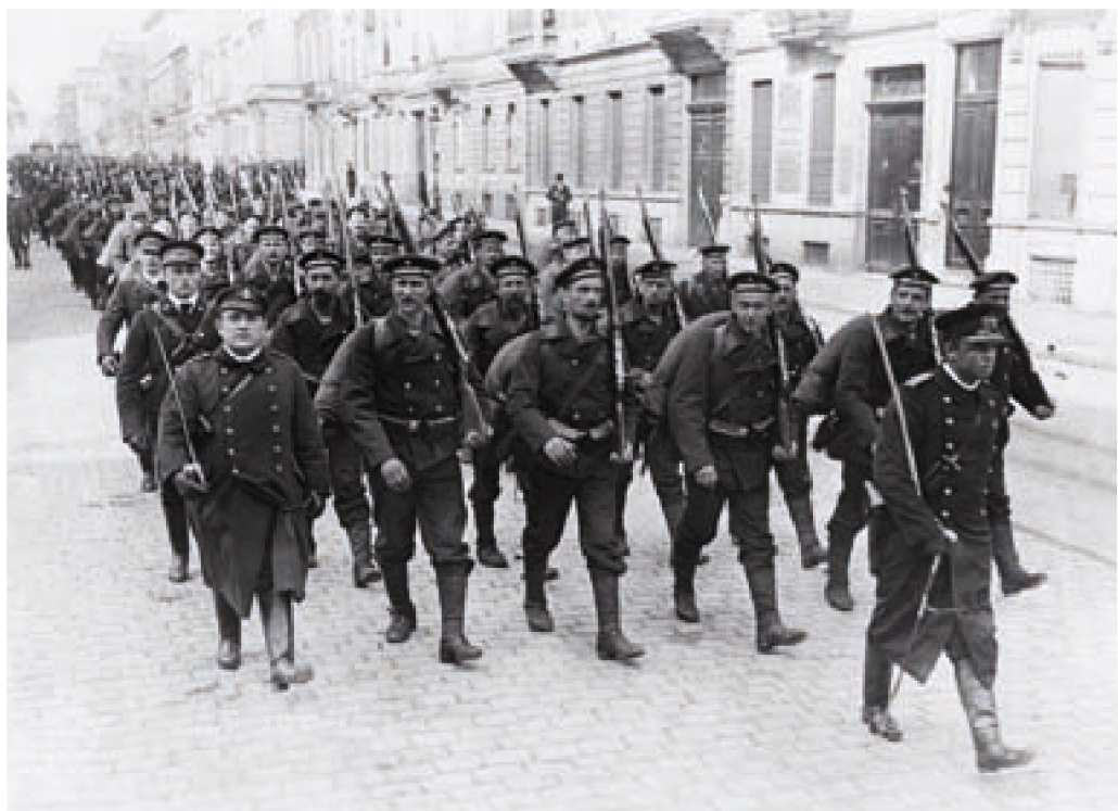
■ The entry of the Navy Division in Brussels

When WWI broke out in 1914, the optimistic idea was prevalent that the war would be short. Both sides were convinced of a swift and glorious victory. The goal of the German Schlieffen Plan to eliminate the French land forces by sweeping through Belgium and Luxembourg, and to take the Channel ports in France to facilitate an attack on Britain was not achieved. The German advance was halted by flooding part of the Yser plain, among other factors. The Germans had only succeeded in taking Zeebrugge and Ostend. At first, the British did not wish to destroy these ports as they assumed they would soon be recaptured.