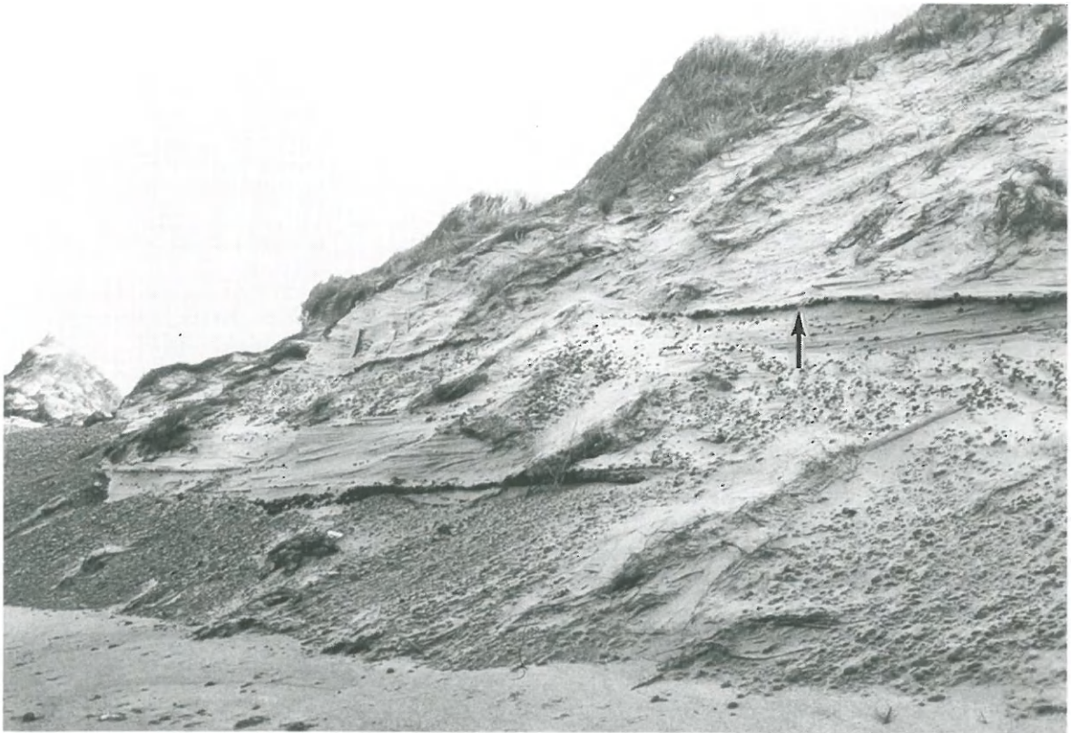
Fig. 1. Section of spit deposits, coastal cliff south of Højen, Skagen Odde. Note the prominent stone horizon (arrow) that separates lowermost shoreface and beach deposits of pebbly sand and gravel from uppermost dune deposits of well-sorted sand. The stone horizon is interpreted as a deflation lag and most likely formed during the Little Ice Age, when severe wind erosion and sand drift took place. Part of the deflation plain, which can be seen to the left, was later overlain by dunes. The stone horizon occurs c. 5 m above sea level.

Hauerbach (1992) noted the occurrence of a rather continuous stone horizon in cliff sections at the west