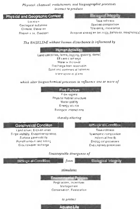
Fig. 2 Relationships among the elements and processes of natural systems, the kinds of changes that occur as a result of human actions, and a framework of environmental policies that might come from an assessment of biological condition, the endpoint of primary concern to society. (From Karr & Chu, 1999).

integrity, we can thus focus on the most integrative, biological endpoint. During the twentieth century, as knowledge and societal values changed, and human-imposed stresses became more complex and pervasive, biological monitoring evolved rapidly. At least two major approaches developed independently over the past 25 years.