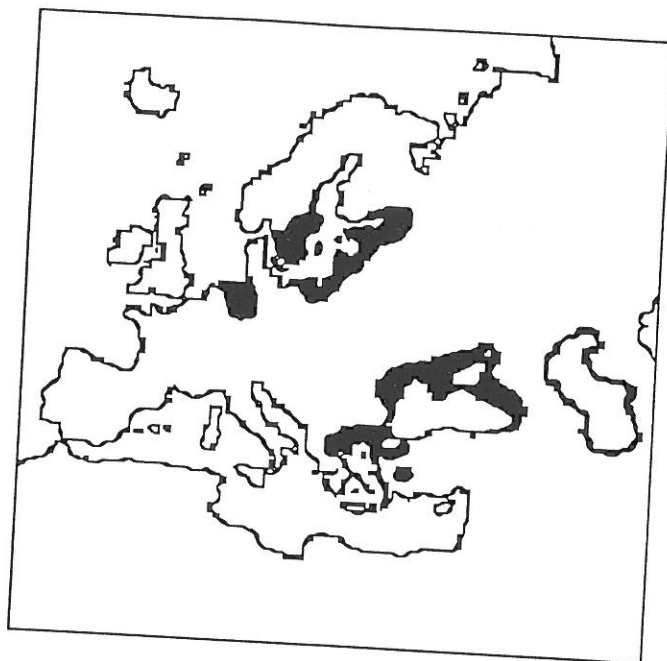
Map. 1. Distribution of Vimba vimba (from Ladiges & Vogt, 1965; modified).