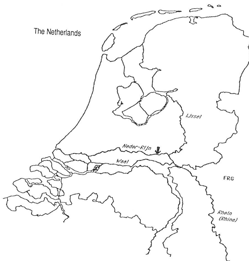
Map 2. Location of catch of Vimba vimba (arrow).