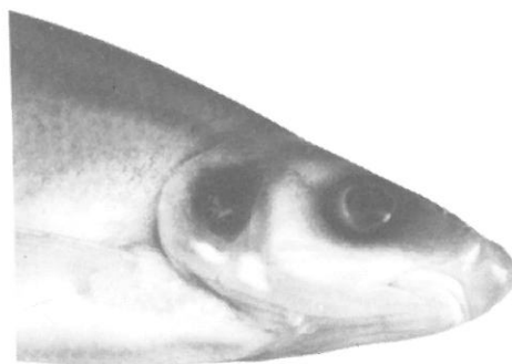
Fig. 1. The specimen of Vimba vimba caught in a sand pit in connection with the river Neder-Rijn near Heteren (The Netherlands).