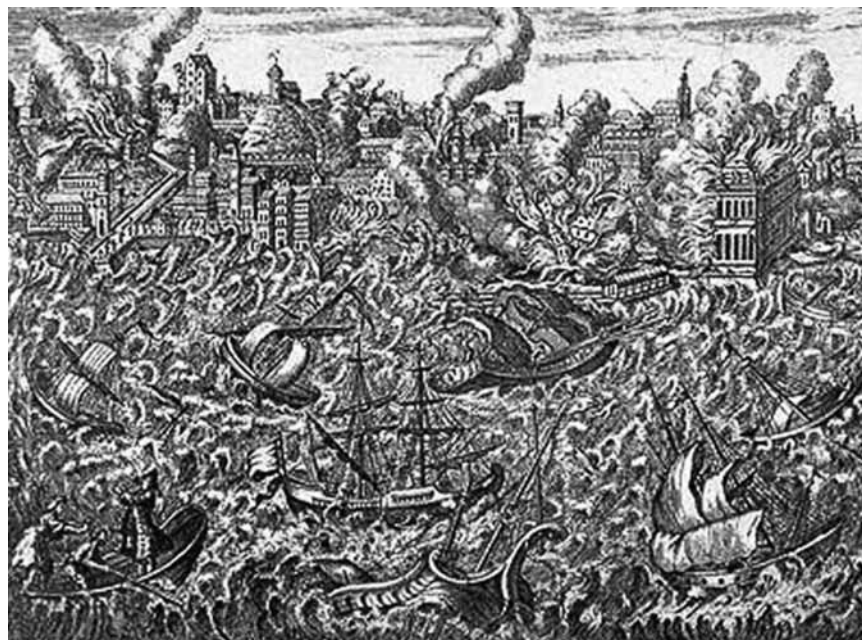
Fig. 1. — Representation of the Lisbon 1755 sea/earthquake (HALLER 1756).

Liege, the vibration of soil persisted several days; many buildings were cracked there or even ruined entirely, and several inhabitants were there victims, some of these accidents, others of their fright. In Belgium, the Marlagne, the Ardennes and the vicinity of Namur felt the effects of this crisis, without suffering however considerable damages” (TORFS 1862, pp. 158-159; LANCASTER 1901, p. 208).