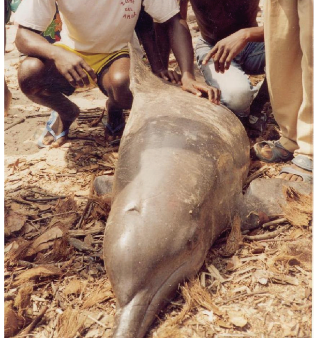
FIGURE 4: A Cameroon dolphin captured by artisanal fishermen near Campo, southern Cameroon, on an indeterminate date in 2012.

The only specimen evidence of S. teuszii in Cameroon (since 1892) consisted of a dolphin captured and landed by small-scale local fishermen on an indeterminate date in 2012 near Campo (N02°22.861', E09°49.4654') in southern Cameroon (Figure 4). Although 81% of interviewed fishermen had seen dolphins from shore, none positively recognised S. teuszii from photographs, and 87.5% answered a resolute “never seen.” In contrast, almost all fishermen recognised T. truncatus , a species not encountered during our surveys. However, a photo of a common bottlenose dolphin landed at Yoyo II (N03°40', E09°38') in 2003 and examined