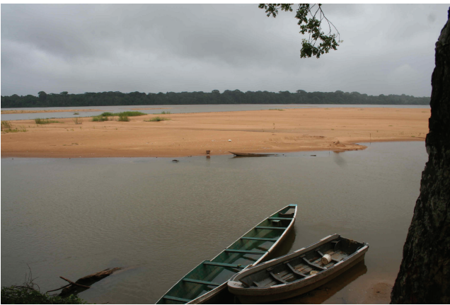
FIGURE 3: Despite its historical name “Cameroon River dolphin” implying potential riverine habitat, we encountered no dolphins in Cameroon’s wide Sanaga River; their absence was confirmed by local fishermen.

including piracy. Artisanal fishing effort and nearshore boat traffic were very intense near Idenau. Dozens of large canoes equipped with high-powered outboard engines transported merchandise and passengers to and from Nigeria. These noisy, high-speed crafts would almost certainly disturb and chase away any humpback dolphins, if present.