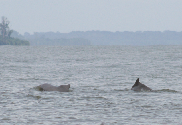
FIGURE 2: Two adult Cameroon dolphins Sousa teuszii , part of a small group of ca. 10 individuals foraging nearshore at Bouandjo, 17 May, 2011. This is the first authenticated sighting and the first evidence since 1892 of the presence of S. teuszii in Cameroon.