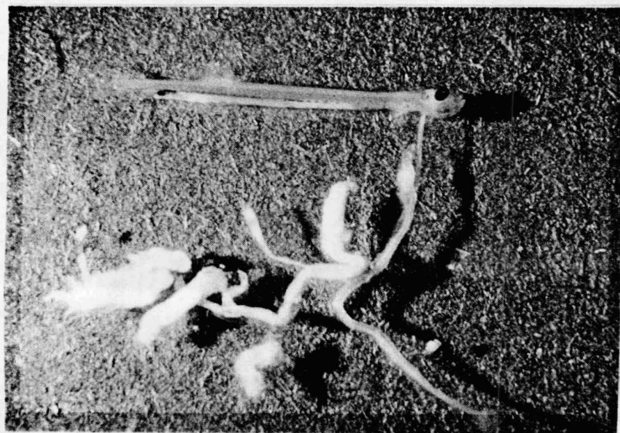
1f: after 60 min. in a stomach, also containing mysids.