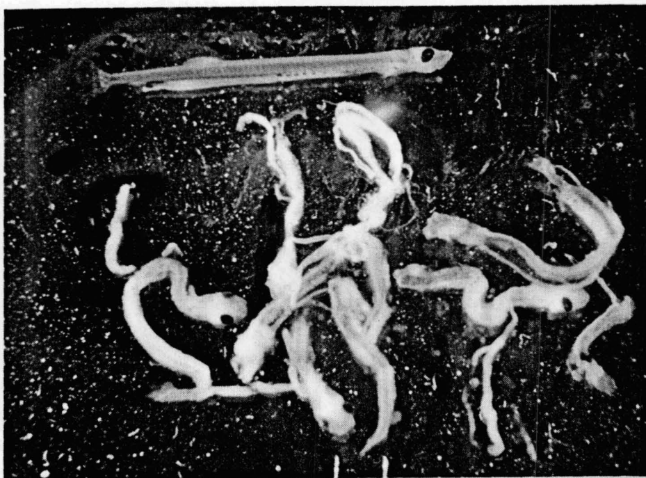
1a: after 15 min.