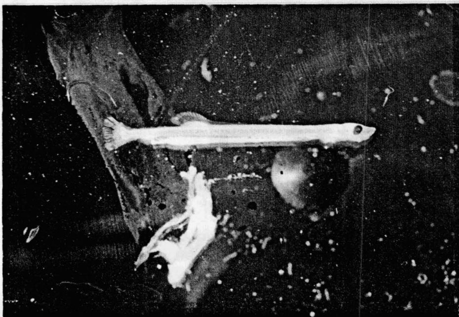
1c: after 60 min.