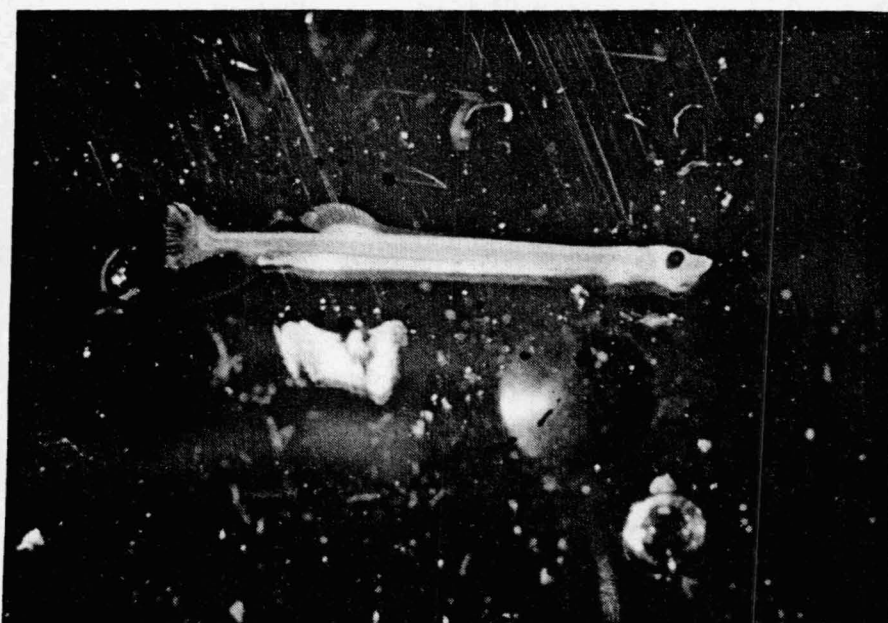
1d: after 60 min.