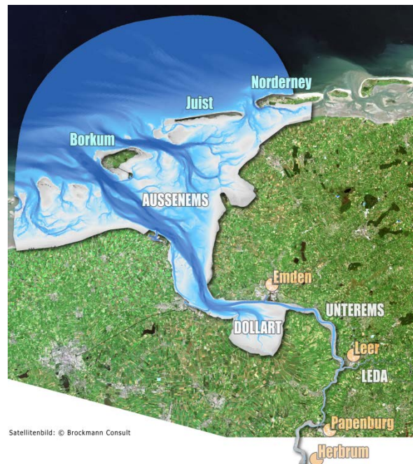
Fig. 2. Satellite image and model domain of the Ems Estuary.

This approach will be applied to the 3D model of the Ems Estuary (Fig. 2). The results will be compared to field measurements. Moreover, a comparison of the results with numerical simulations of different methods (classic Newtonian and isopycnal non-Newtonian) will be performed.