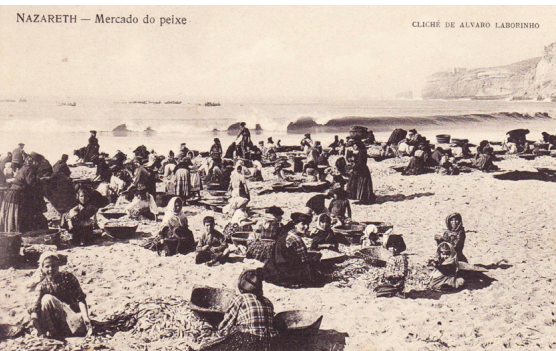
Figure 2 – Postcard “Nazareth – Fish Market”. Álvaro Laborinho cliché. MDJM inv. 634 Doc.

stories and proposes a “memory of dilacerations, of ruptures (...). The memory of losses.” That is why, even today (and more than ever, before the new challenges brought about by mass tourism and modernity), these pictures are so meaningful for the Nazaré community.