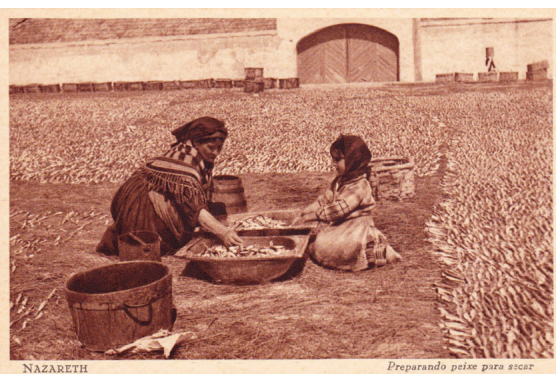
Figure 3 – Postcard “Preparing the fish for drying”. Álvaro Laborinho cliché MDJM inv. 1784 Fot.

We can talk of the “usage of memory” when a museum has the power to preserve for the future the past and present representation of the community. As an entity with responsibility for the patrimonialization of the sea, the Museum of Nazaré, who keeps this photographic collection, is part of a current debate on the redefinition of Nazaré’s identity. Today, and in syntony with other traditional maritime centres, Nazaré forges new forms of relations with the sea, besides fisheries, under an increasingly ecological perspective and related to scientific research, sports and tourism.