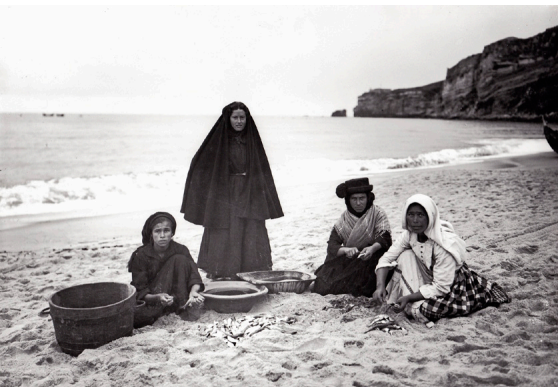
Figure 1 – Álvaro Laborinho, “Women on the beach, gutting the fish”, 1915. MDJM inv. 1483 Fot.

Since its invention, photography has been seen as a privileged medium for representing everyday life, with an impact never achieved by any other pictorial figurations, due to its nature as an apparent portrait of reality, combined with the ease of its reproduction. But this assumption, that there is an image “itself”, comes up against the recognized polysemic character of the photographic image. After all, photography weaves a story, through the selectivity of focus, and creates “visual disdain” (Martins 2008: 36), keeping from everyday life just what “is worth” to be kept, what we want to remain from each day. Therefore, photography is not a qualified means of documentation when it comes to daily life, because it documents, above all, the mentality of the photographer and of those who use his product. The only way to turn photography into a “mirror” is to look beyond the mirror, that is, to understand photography in order to be able to understand the society that is proposed and imagined through photography (Martins 2008, 46, 51).